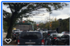
Union Street Bridge