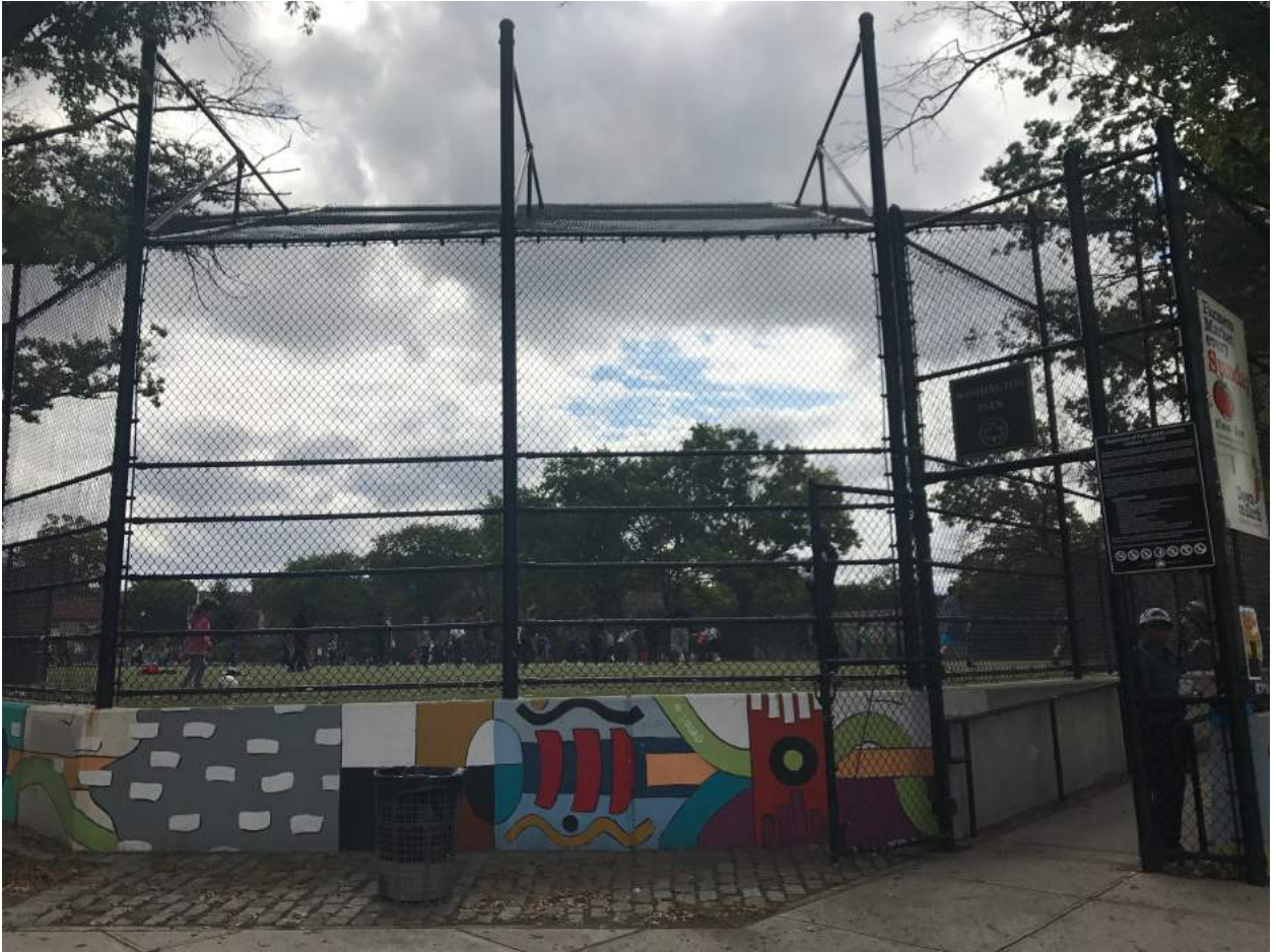
This was the play area of Washington Park's field. This is a perfect example of a public place because it's open to the public of all ages.