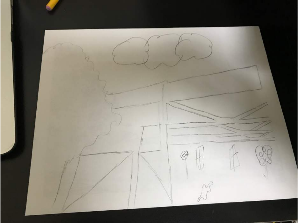
This is a rough sketch of the bridge right above the construction of Washington Park. It shows trees and a bridge of where there is a highway right above.