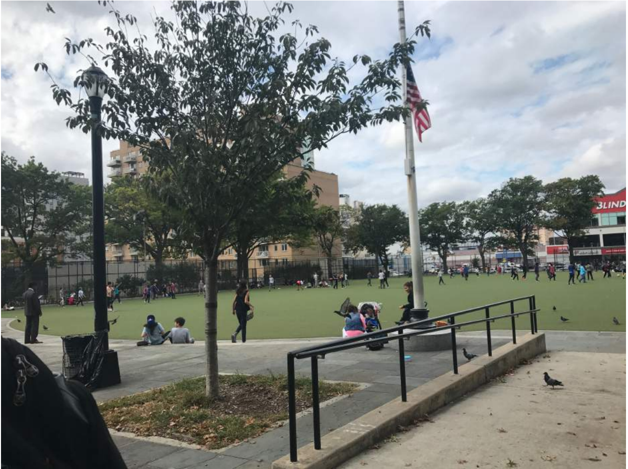
This image shows the cleanliness of the park and the civil environment it carries. Just this image gives you a sense of how people act or the different activities that take place here at the park.