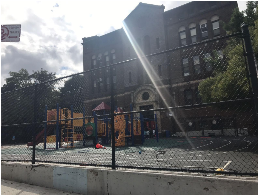
Play ground at a public pre-k school.