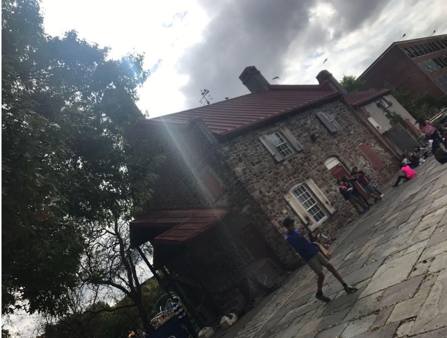
The Old Stone House; reconstructed in 1993.