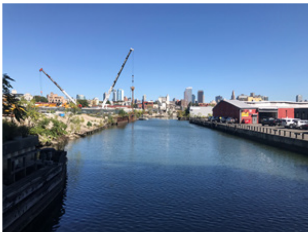
Gowanus Canal view from 9th Street Bridge