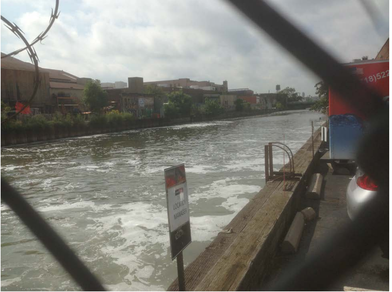
1A* Graffiti right along the border of the canal.