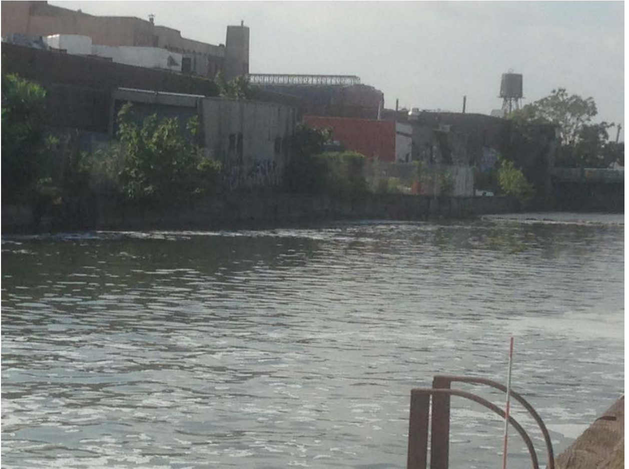
1A *The poor vegetation along the canal.