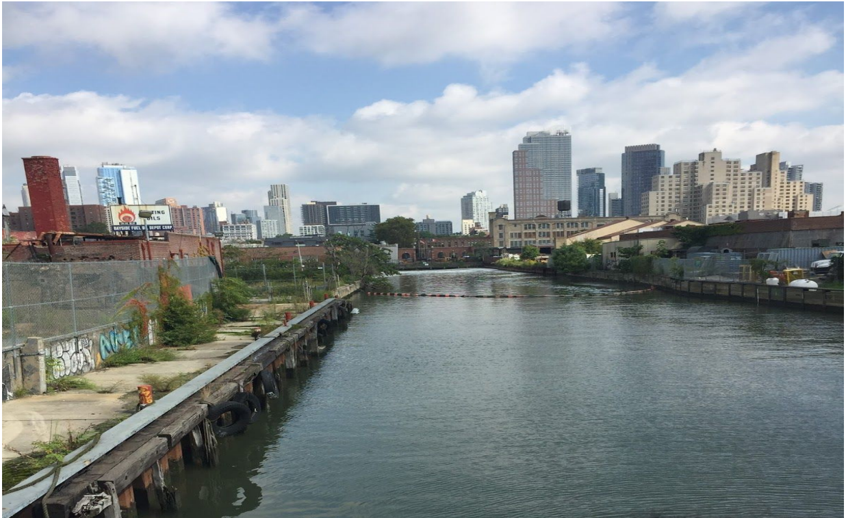
The view of the Gowanus Canal from the first bridge at Union Street.

This image is good because it shows how green the water of the Gowanus Canal is. You can tell there's a lot of pollution in the water and if you were to zoom into the picture, at the start of the canal, you can see that there's foam on the top of the water. This comes from the runoff from rain and sewage near the canal. Also comes from the added oxygen that they add when they bring in water from the East River. You can also notice some graffiti on the walls on the left of the picture and that is a symbol from the many artists that live in the Gowanus Canal area, of which we will see more in the next image. Lastly, what left to notice is how there are no residential buildings directly next to the canal in this area. Only a few industrial businesses such as parking lots. I did not see any parks or playgrounds in this area and that may be because the area is very industrial but that may change in the near future.