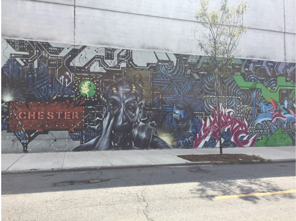
An image of the many artwork from the artists who live in the Gowanus area.

There is a large community of artists in the Gowanus area and this image shows only one of the many art pieces that they make on walls. Everything that happens in the Gowanus area greatly affects them and I thought it was important to show some of their art as this will probably get painted over or destroyed in the upcoming years. It seems studio space is getting more and more expensive for them and with the new developments that are occurring around the canal will only make the prices get even more expensive. But, this is not the only kind of art in the Gowanus area. We also went by a small little shop where the owner sold all sorts of pottery and mirrors and a lot of small home appliance things, which is another kind of art.