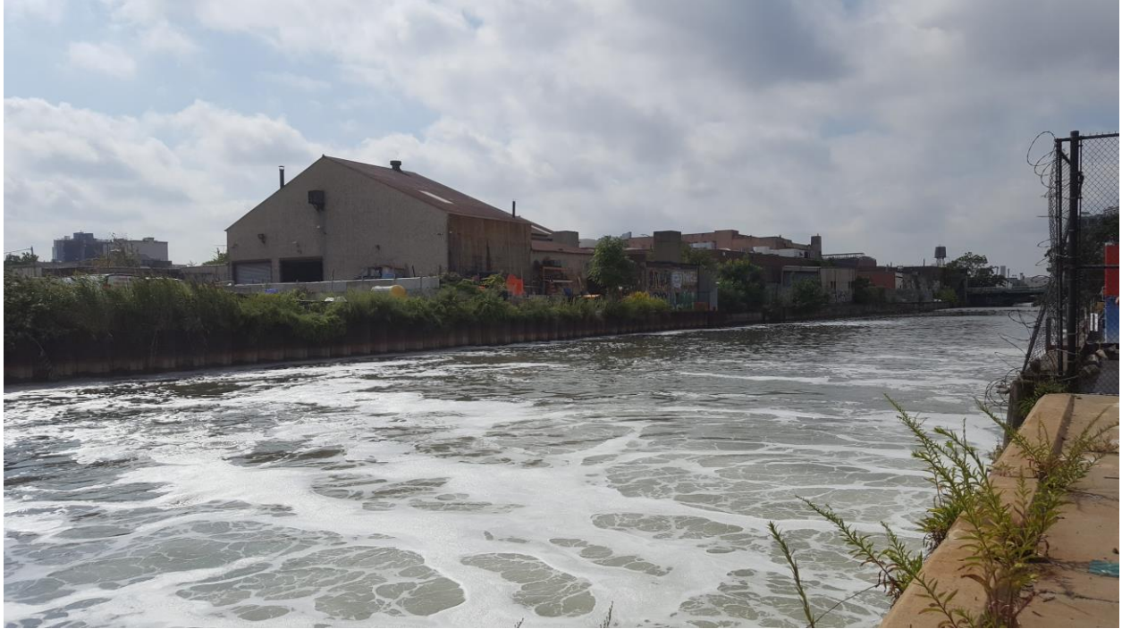
This is an expanded view of the Gowanus canal from the end of the canal. This image shows the conditions of the water and what surrounds it.