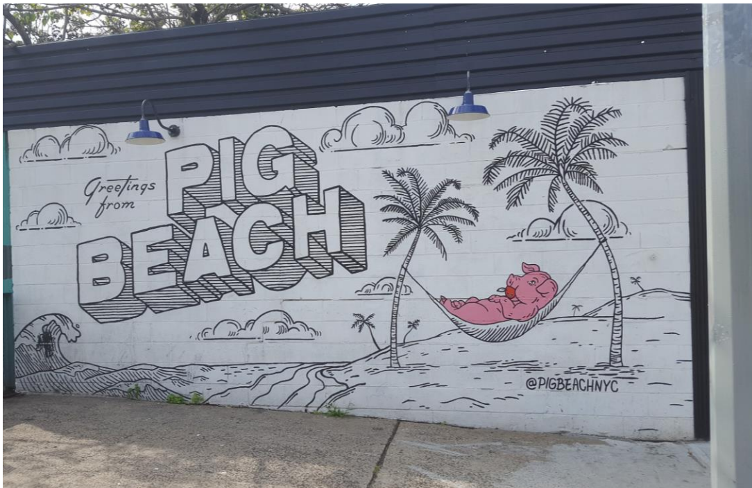
This was taken right next to the Canal and near one of the bridges. Artists are trying to bring a thought of a nice relaxing beach into a viewer's mind.