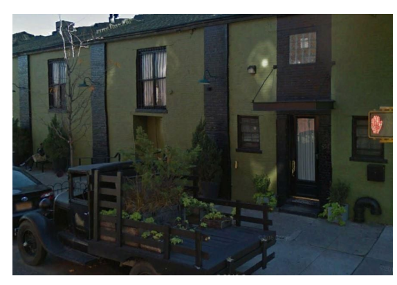
"Every place needs a little Green"

b. What is the program of the space? How are people meant to interact with one