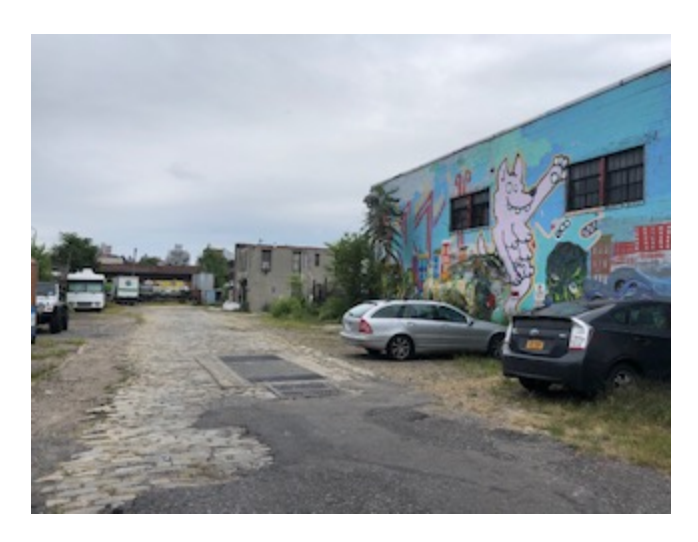
" DO NOT ENTER "