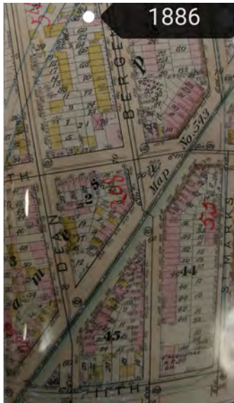
Barclay Center Map of 1886