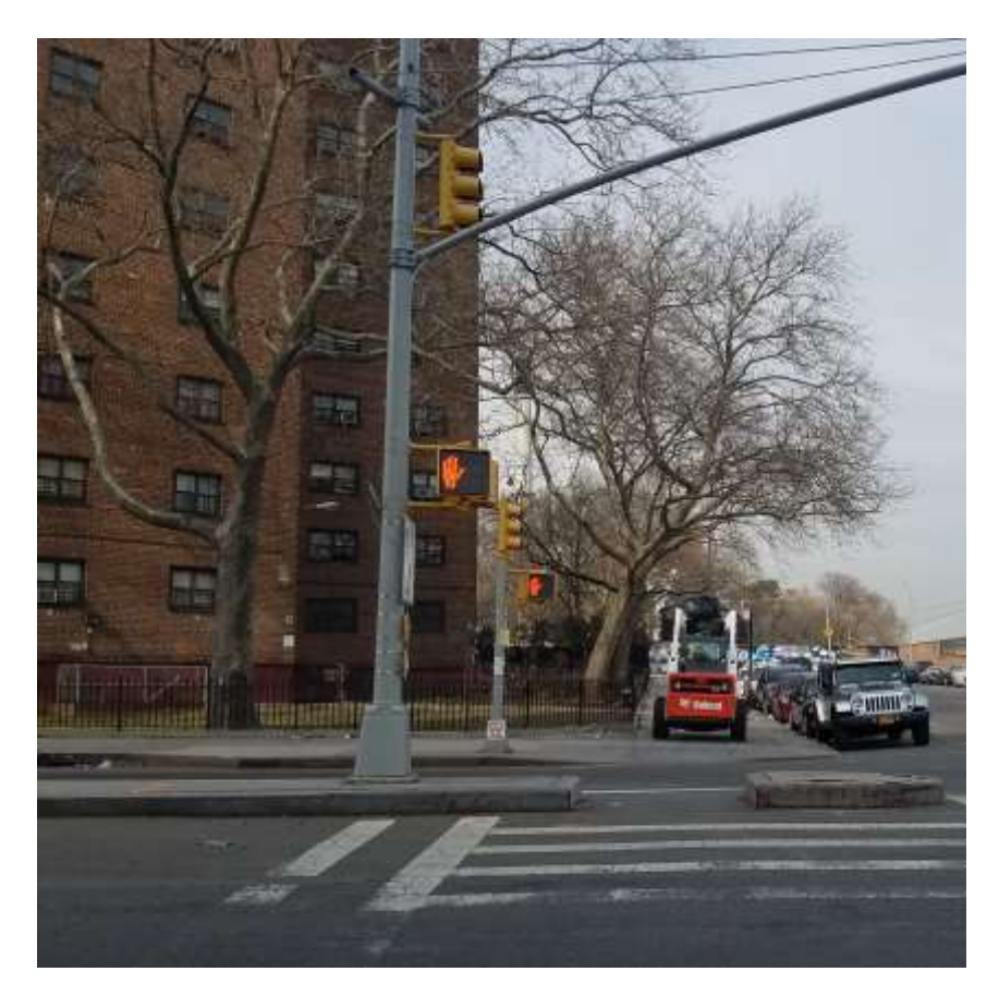
3rd Stop - Corner of Sands St and Navy St

During my first visit, I thought transportation for the people living in Farragut Houses is a big problem as we didn't really go through the housing but we found out that they have bus stops almost every corner of the streets and they also have Citi bike stand right by the corner of Navy St and Sands St. So, my assumption of troubled transportation for Farragut houses' residents is a mistake.