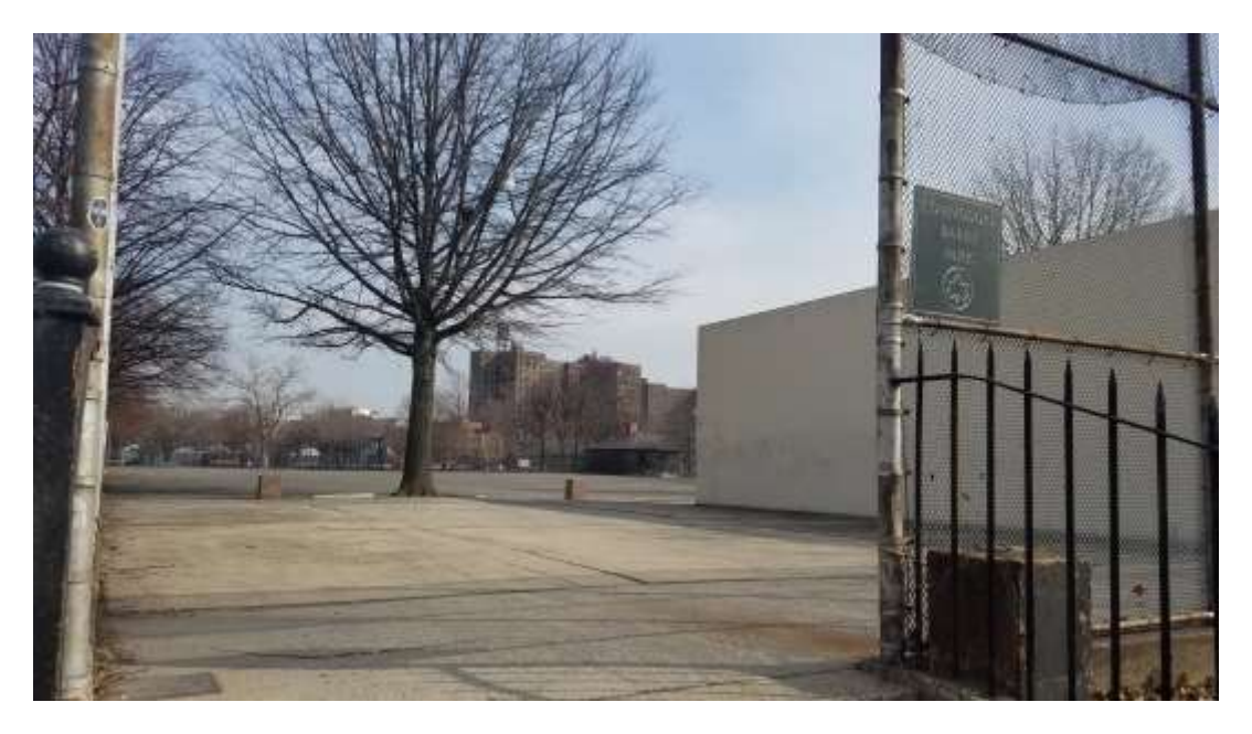
5^{\text{Th}} Stop \rightarrow Farragut Houses Playground by York St and Hudson Ave

As we walked deep through the neighborhood, we saw many open spaces and playgrounds and parks but they were all empty especially the playground by the corner of Navy St and Sands St as it looked more like a big empty lot full of concrete rather than a park.