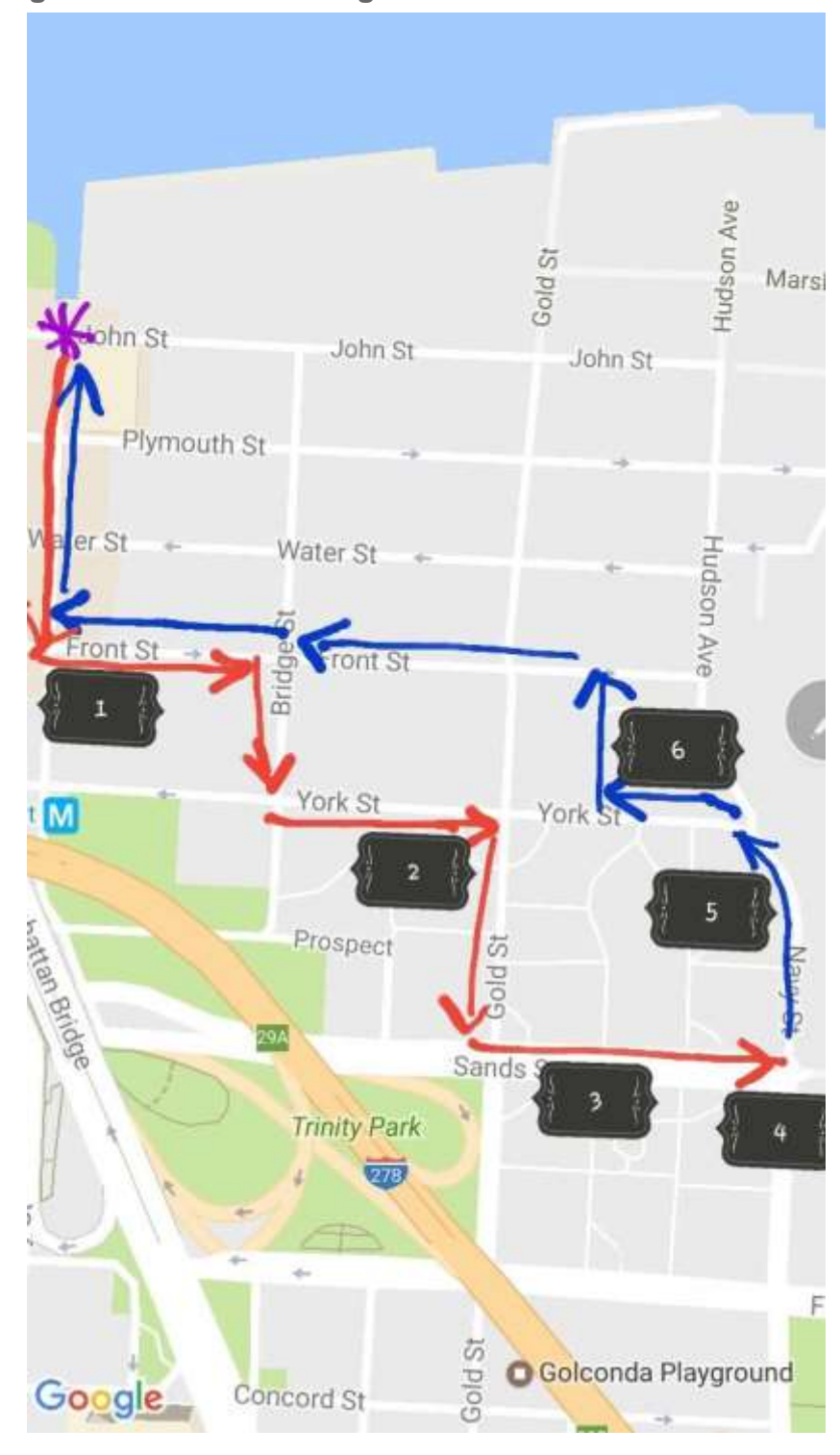
Route to Farragut Houses and its neighborhood →