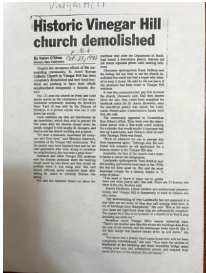
Article related to the Historic Vinegar Hill Church

SITE DOCUMENTATION: photos/sketches of 2 or 3 significant primary sources. Provide captions and explanations – why is the image shown significant for your topic of exploration?