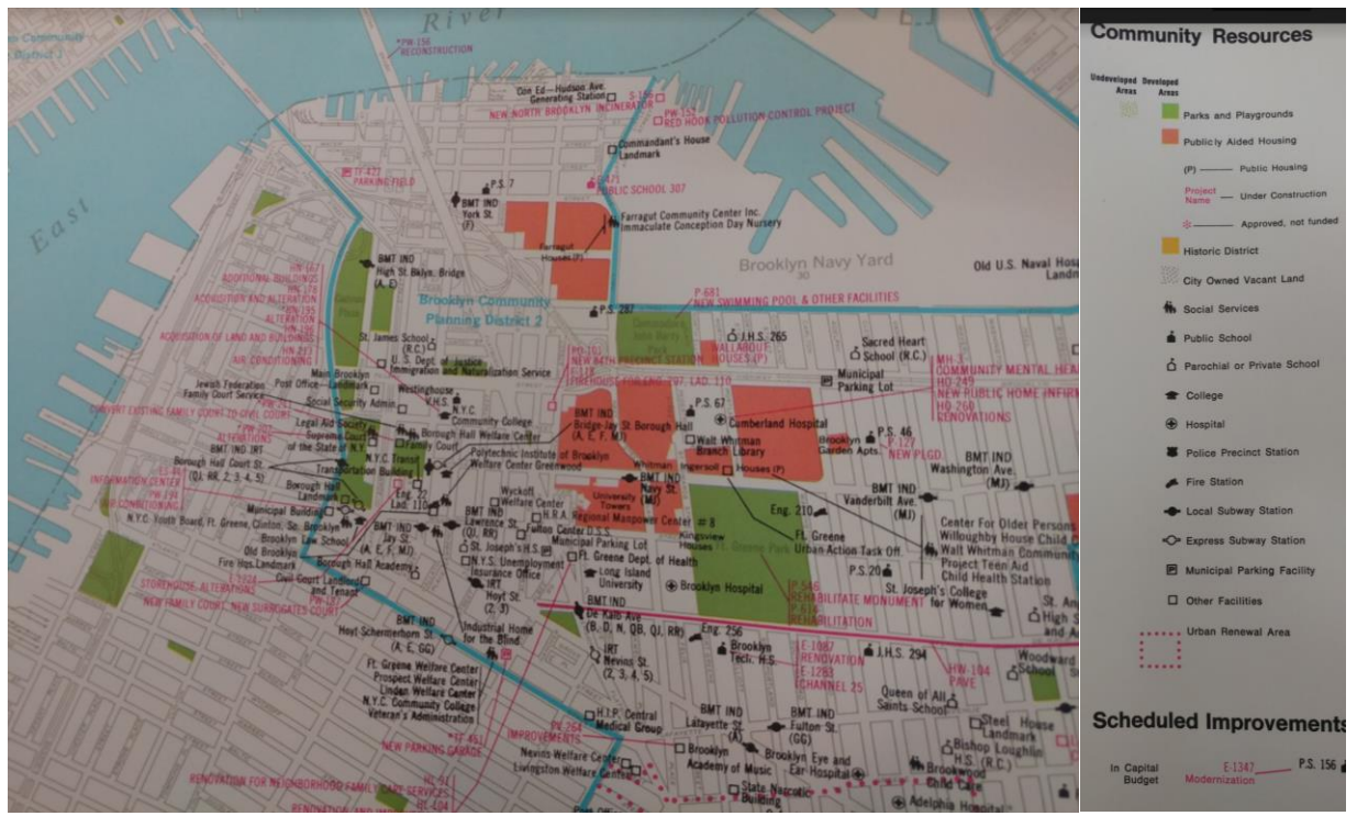
Map of Vinegar Hill, no exact year was provided but I can take an estimation that this is around the early 1900s.

I came into the Brooklyn Collection trying to find items that would tell a little more about vinegar hill and its potential growth. I came in to see if I could find information on the bakery that has been around the 1930s. Not only that but I wanted to find maps of the area because my thought of mine was the origin usage of vinegar hill. My idea going into the collection and handling very old pieces of document was that at some point it would fall apart, after all some of the document in there are over 100 years old. So, going in I kept in mind that I had to be extra careful handling some of these documents.