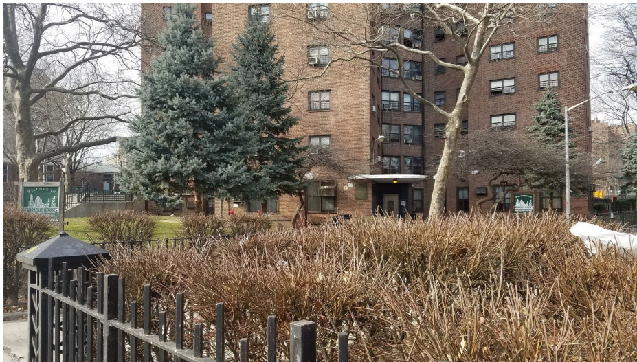
Farragut Houses: Dead shrubs but lively trees.

SITE DOCUMENTATION II: photos/sketches for 2-3 significant stops. Provide captions and explanations – why is the image shown significant for your topic of exploration