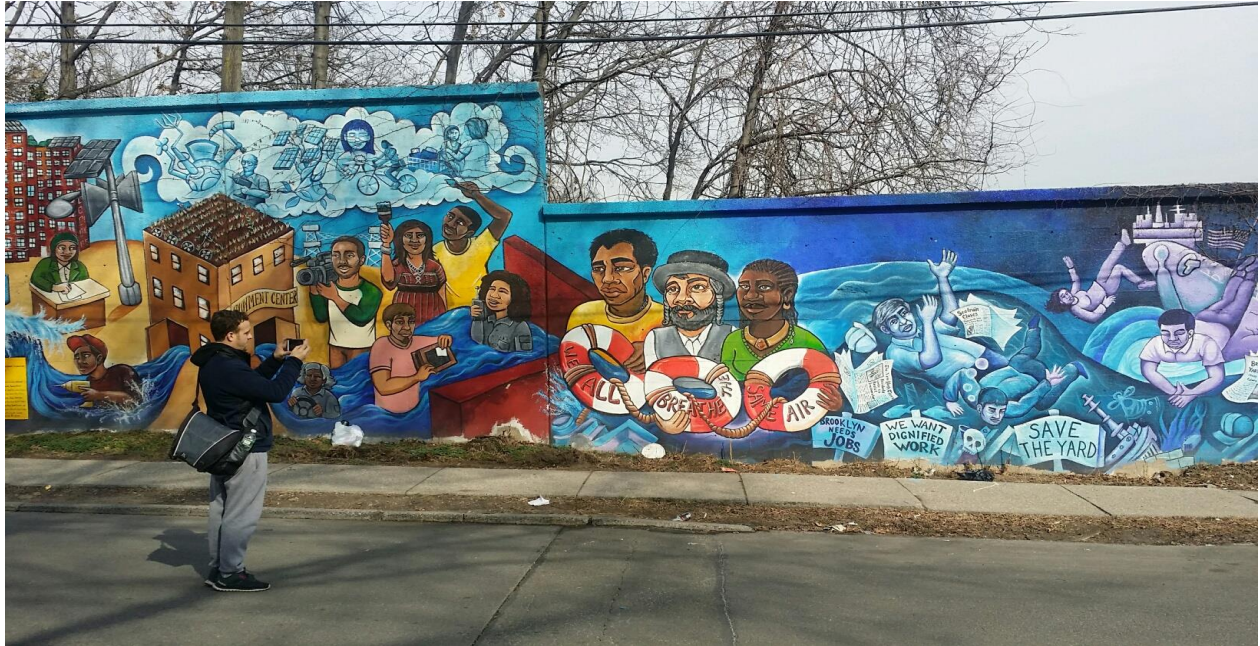
This is one section of the navy yard mural on Hudson leading into Navy St. It illustrates the communities desire to restore the Navy Yard as well as employment that it provided for thousands of residents.