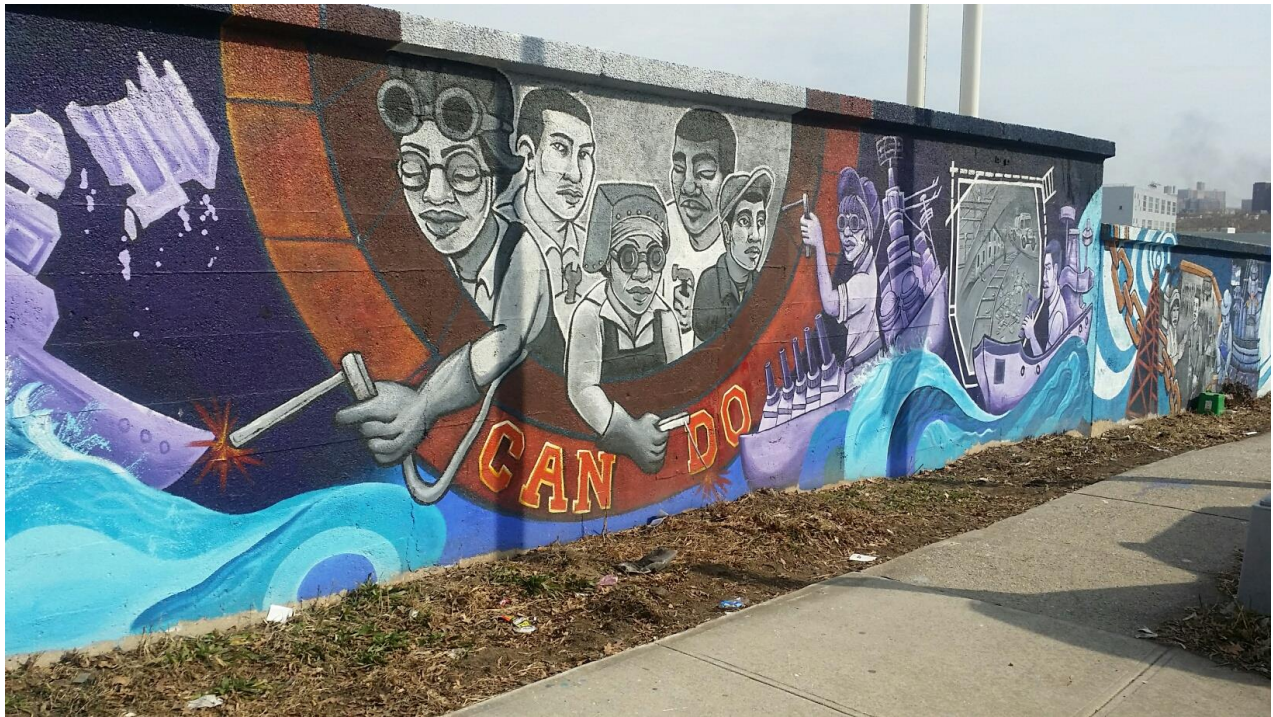
This is a continuation of the Navy Yard mural. It shows the diverse job positions that people held during that era. I believe there was evidence of gender equality when it came to job positions. It's nice to see women in the engineering field.