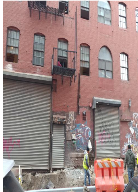
The picture on the left is of a bulletin board in Vinegar Hill, it's written on it 1798. Seems like people still use it because the flyers in it aren't old. The picture on the right shows some construction on the side walk.