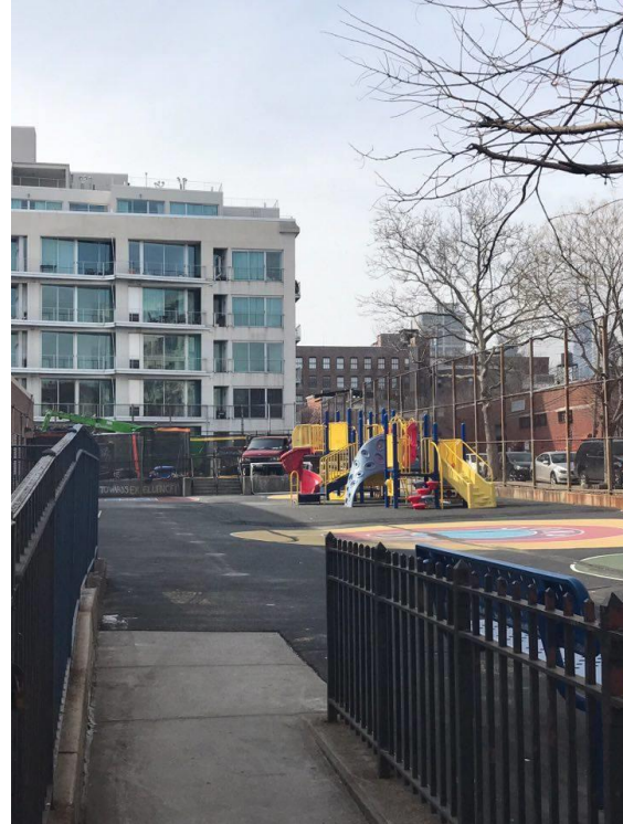
The picture on the left is of a factory that I see on John St. and the picture on the right showing an apartment house that seems much more modern than the rest of the neighborhood.