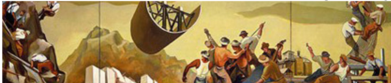
Arch 1290 Architectural CADD & Arch 1200 Architectural Drawing II