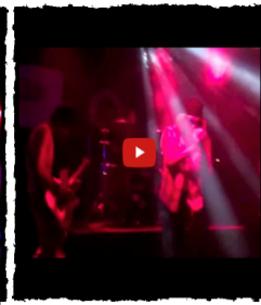
KINKY CATAWAMPUS suicidal beetle