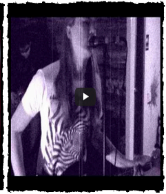
RADON MOON bastard