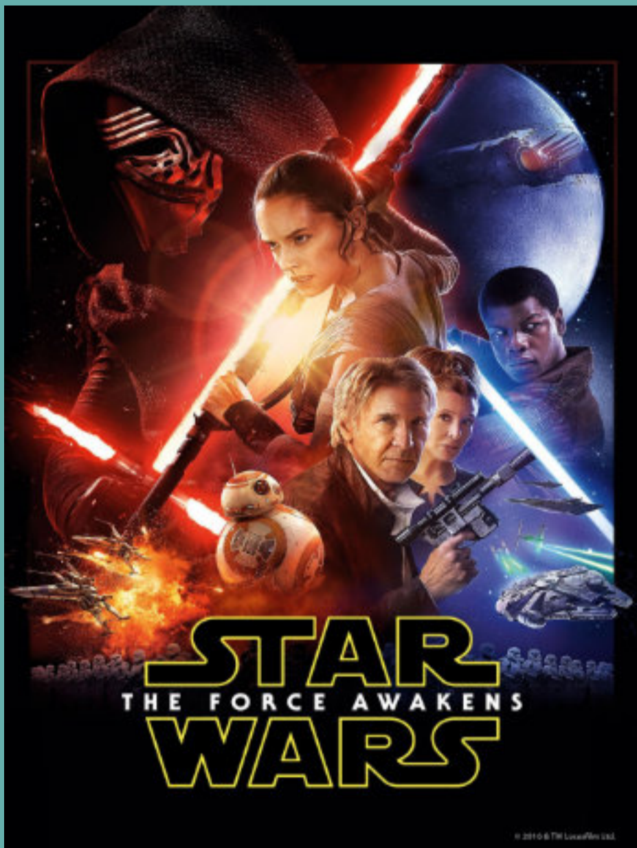
Star Wars Movie The Force Awakens U.S movie poster (Above)

In this Star Wars Poster, the black character is prominent. In this movie he was built up to be an important character hence why he as a light saber, and he is also a main character in Three movies. In graphic design, things that are important are usually stand out bu using color or size. Things that are less important are smaller.