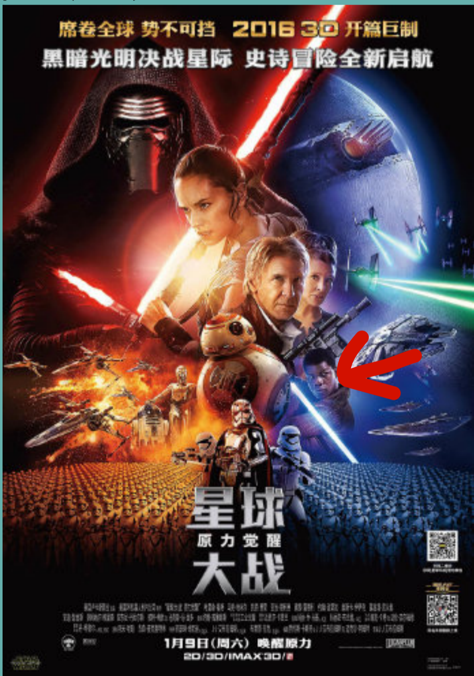
Star Wars Movie The Force Awakens Chinese movie poster

In this Star Wars Poster, the black character is prominent. In this movie he was built up to be an important character hence why he as a light saber, and he is also a main character in Three movies. In graphic design, things that are important are usually stand out bu using color or size. Things that are less important are smaller.