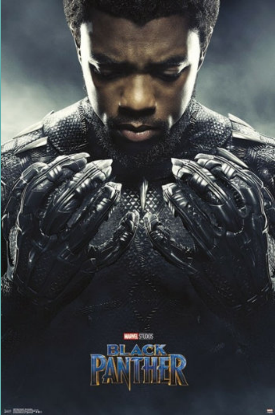
Black Panther U.S movie poster

The black panther movie was released in 2018 and was loved especially by African Americans. The Poster featured Chadwick Boseman with his helmet off, even though i wasn't a big fan of the movie(i gave it a 6 out of 10) i still enjoyed some scenes in it.