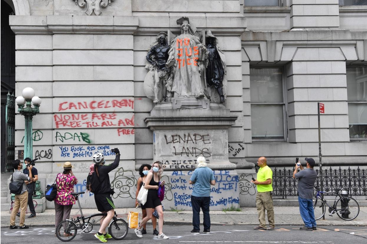
2000 x 1333