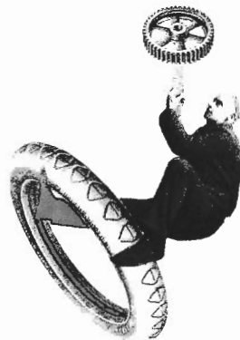
Rodchenko. Self-Caricature . 1922. Cut-and-pasted printed papers and gelatin silver photograph on paper, 7 \frac{1}{4} x 5 \frac{7}{8} " (18.5 x 15 cm)