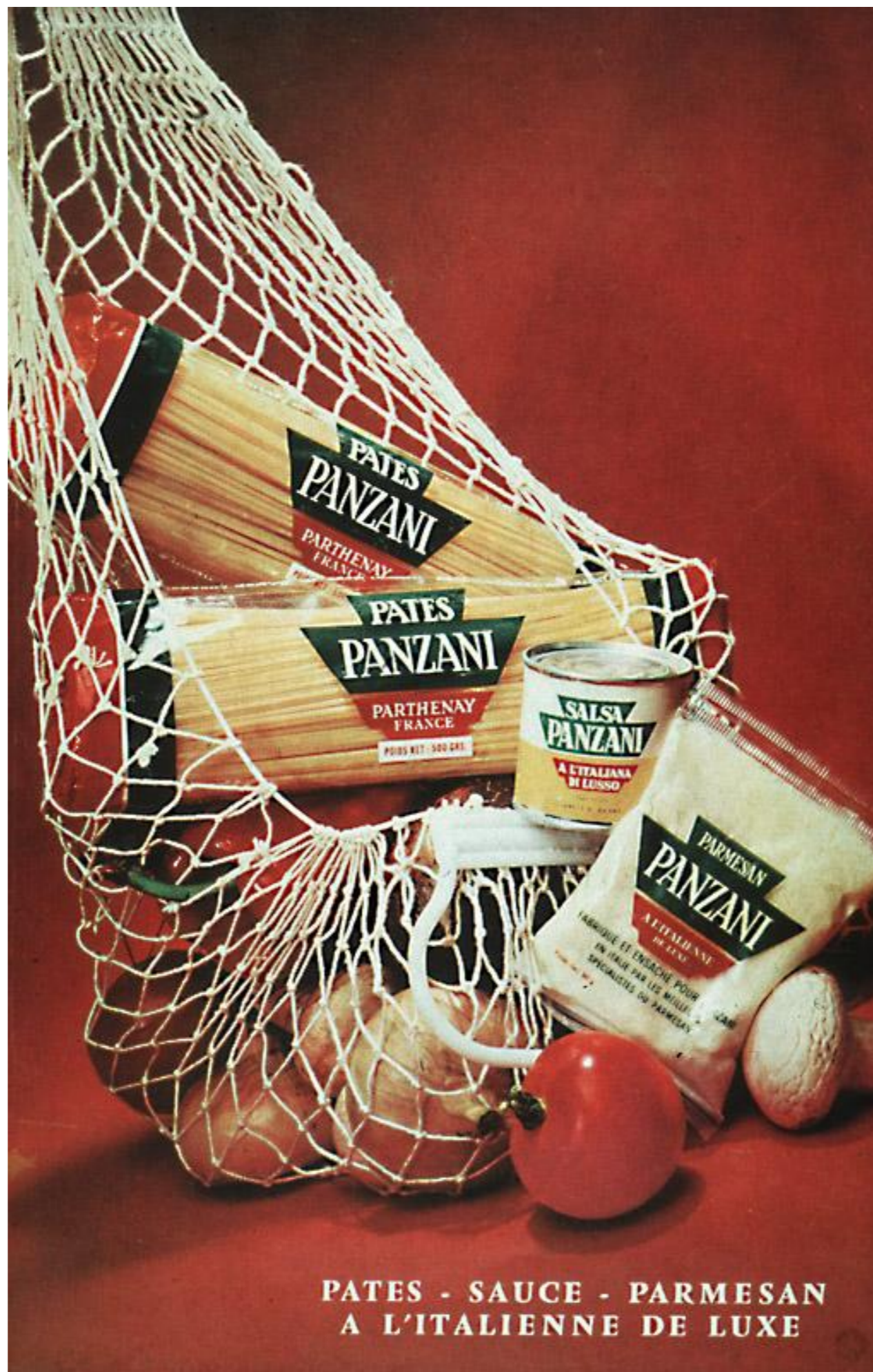
PATES - SAUCE - PARMESAN A L'ITALIENNE DE LUXE