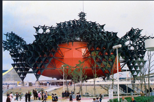
Toshiba IHI Pavilion