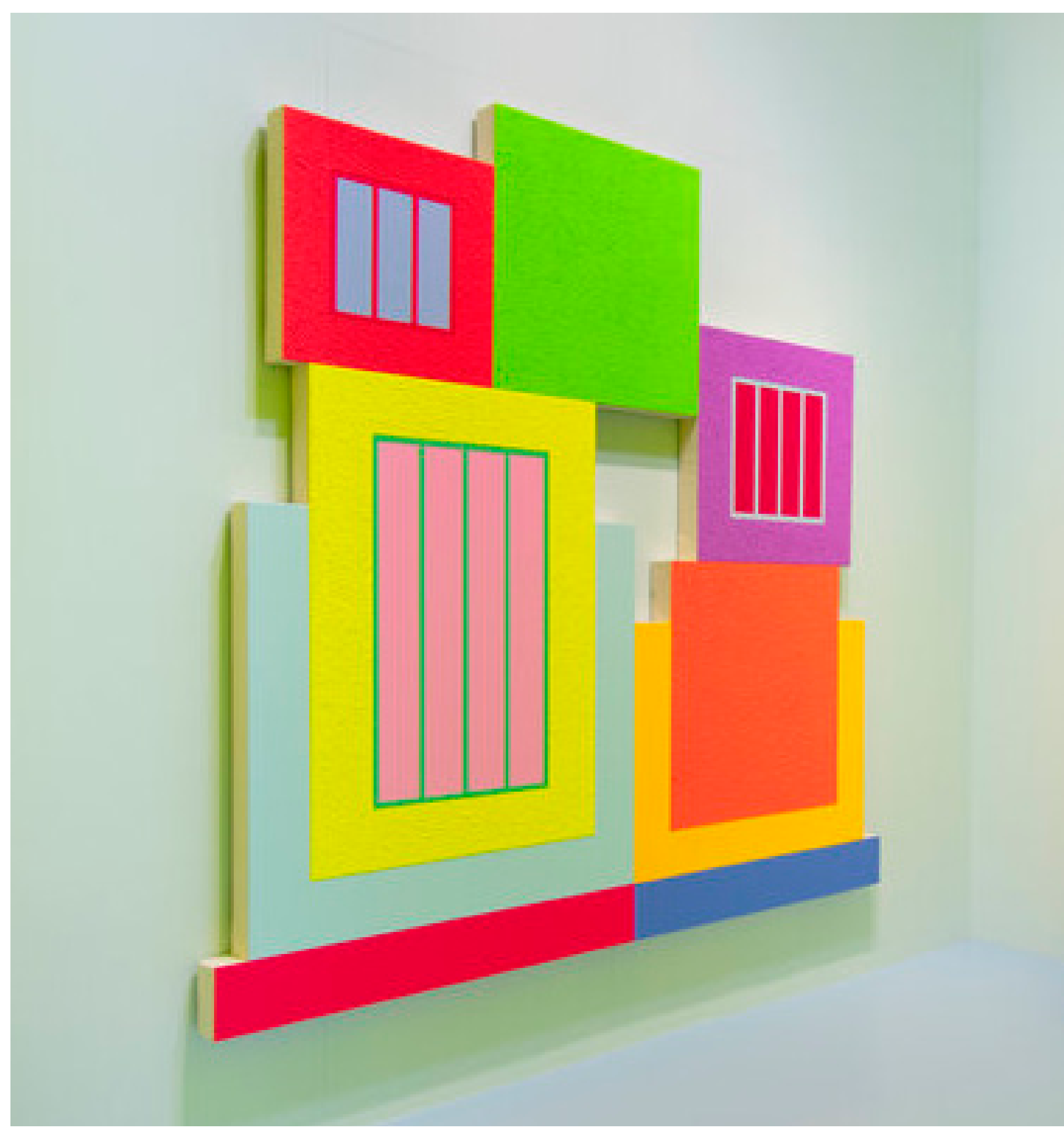
NOVEMBER 2019 HETEROTOPIA II – PETER HALLEY GREENE NAFTALI, NEW YORK