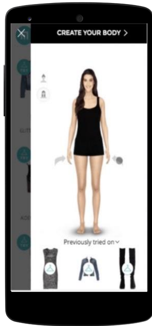
An app where you can try on the ZSB company products.