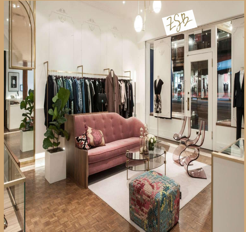
The ZSB Boutique interior design