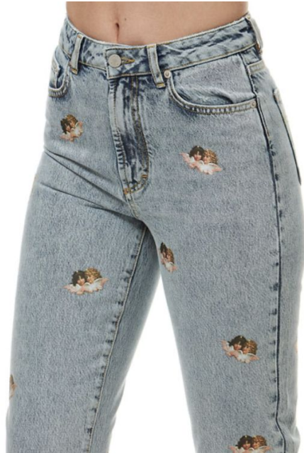
Neiman Marcus- Tara Mini Angels Light Vintage Jeans