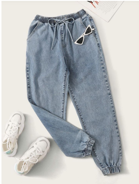
Shein- Drawstring Waist Tapered Jeans