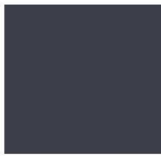
PANTONE® 19-4019 TCX India Ink