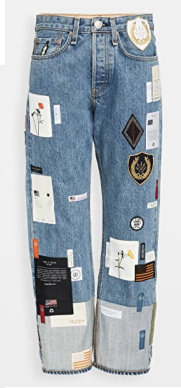
ShopBop- Rag & Bone Jean