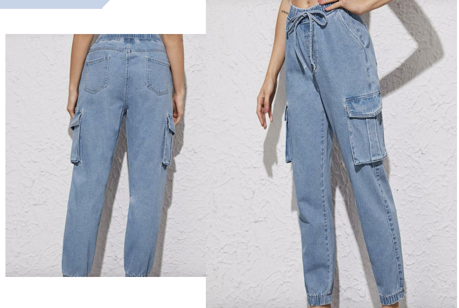
Shein- Drawstring Cargo Jeans