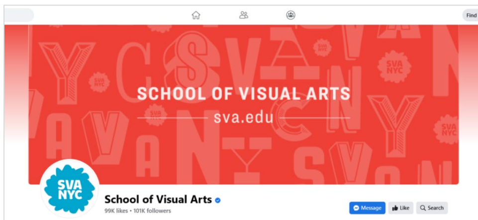
School of Visual Arts Facebook Banner.

My organization currently do not have a logo, however, I plan on designing a circular label type of logo they can use for their social media pages.