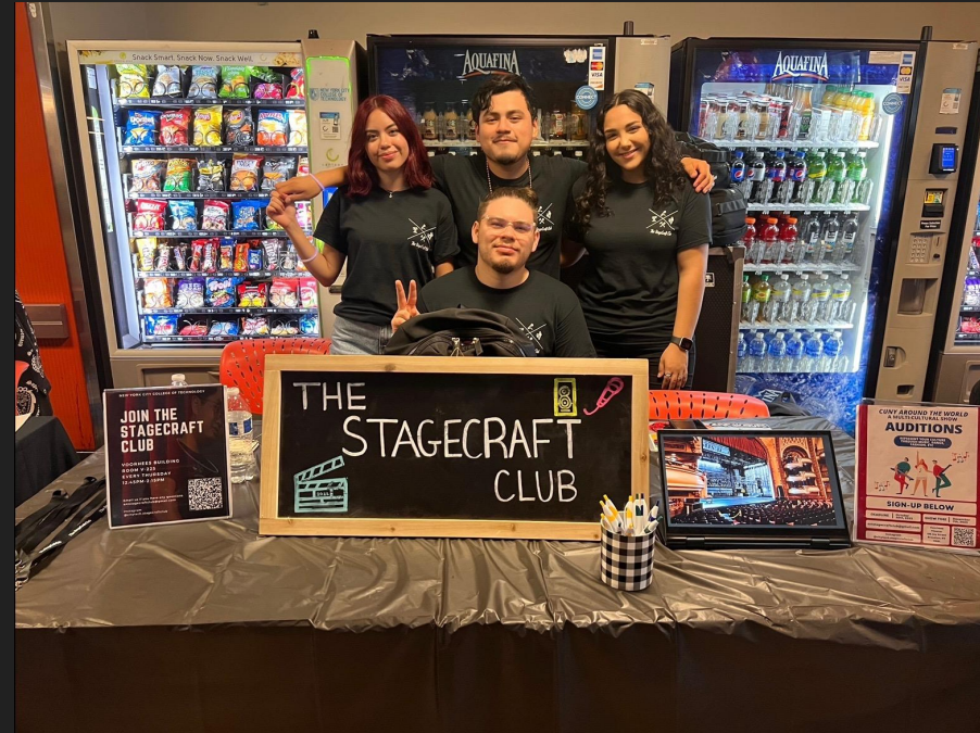
City Tech Student Club Fair - Fall 2022