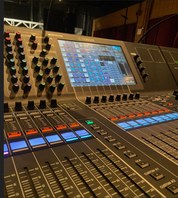
Yamaha CL5 in Voorhees Theater