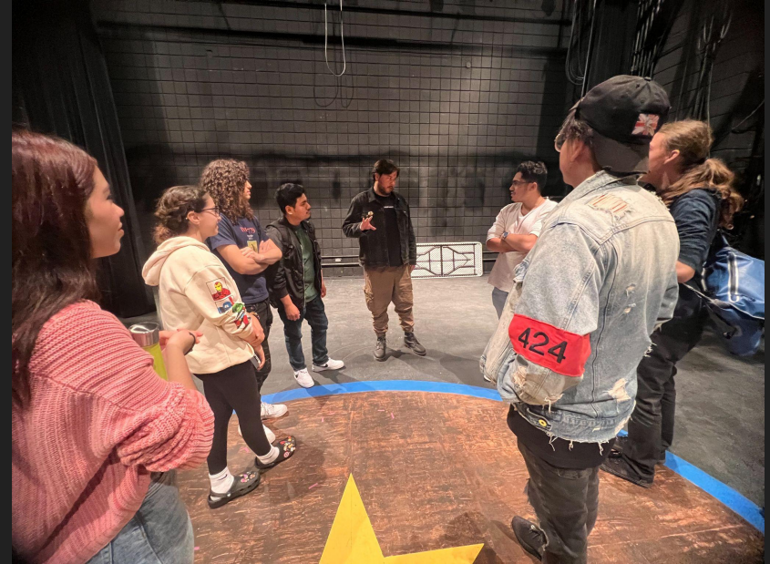
One of the first production meetings - Fall 2022