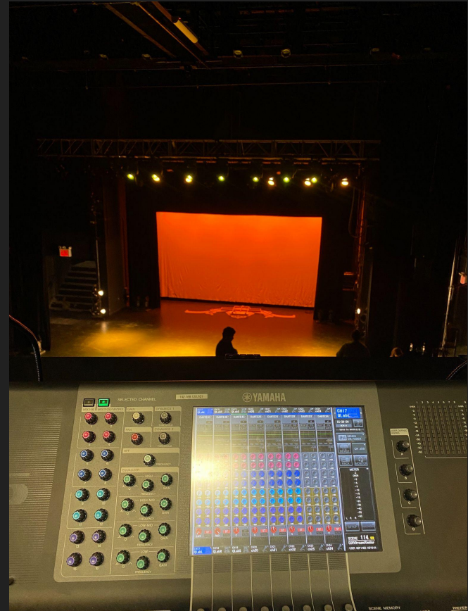
Tech Rehearsal - Morning of Show