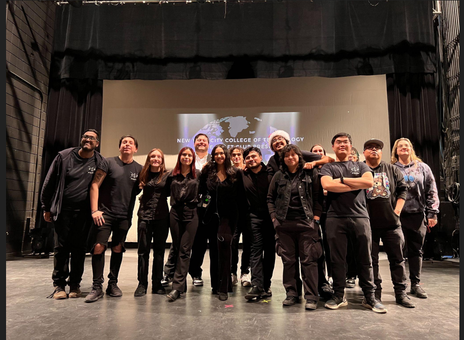
CUNY Around the World Run Crew