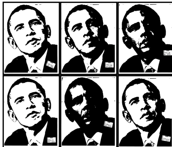
Figure 5: The bitmaps Fairey produced while creating the layers.