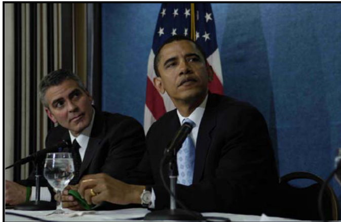
Figure 3: The Garcia Clooney photo.