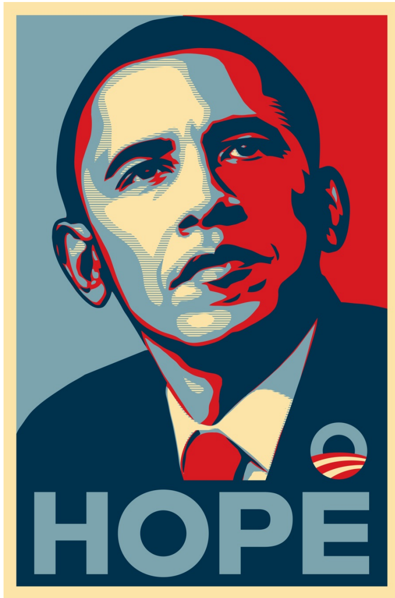
Figure 1: The Hope Poster.