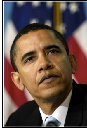
Figure 2: The Garcia Obama photo.