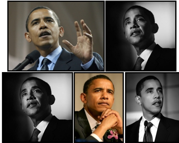
Figure 4: Various finalist photographs that were not selected as reference works for the Hope Poster.