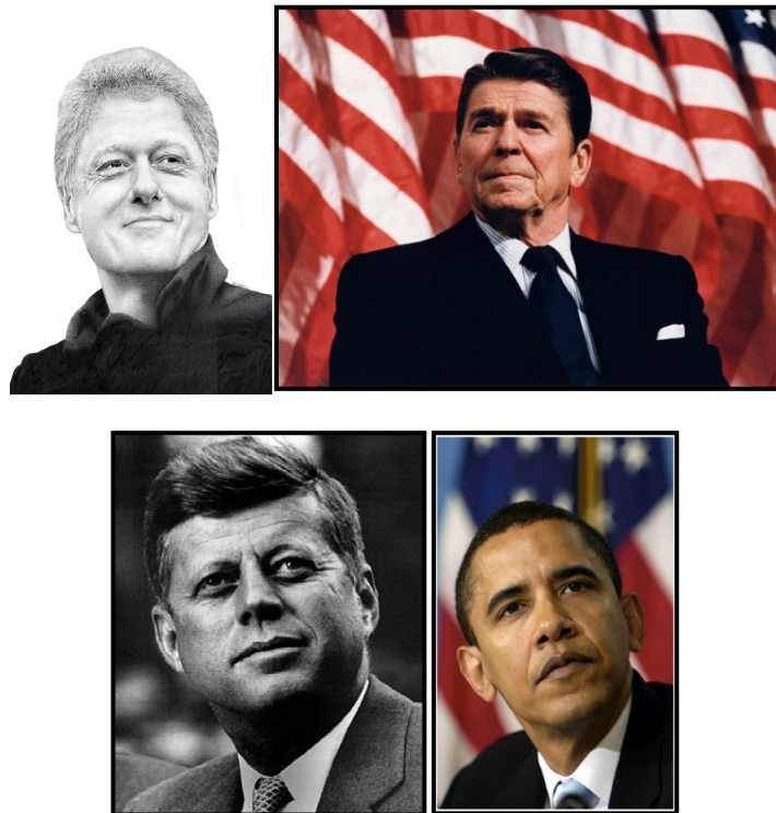
Figure 7: Famous presidential portraits using the “three-quarters pose” juxtaposed with the Garcia Obama photograph.