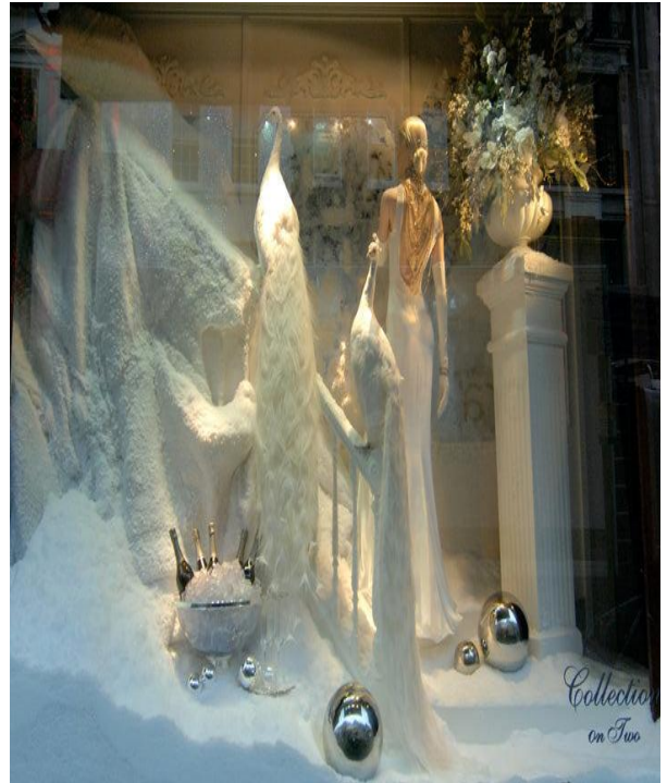
Woman in White