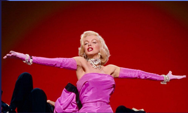
Gentlemen prefer Blondes