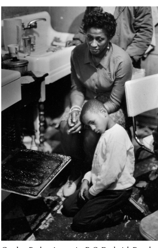
Gordon Parks, Anacostia, D.C. Frederick Douglass housing project. Mother watching her children as she prepares the evening meal. June 1942

This collection of Gordon Parks' photography showcases traditional values, gender roles, & living conditions in the 1940's. Do you still see any of these in 2023?