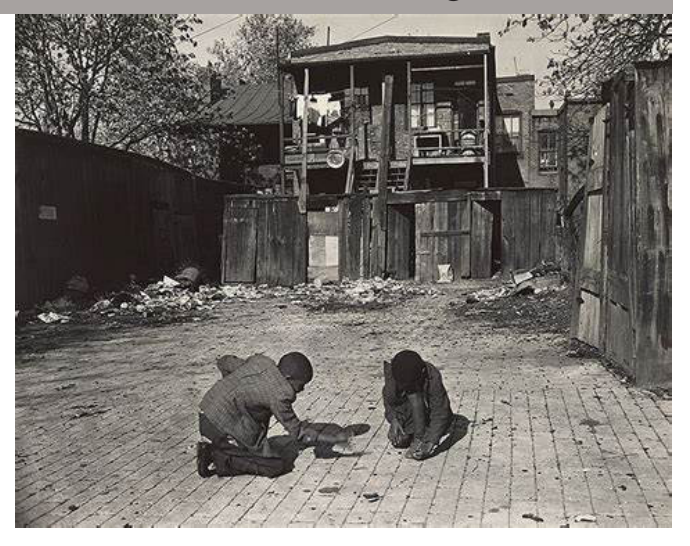
Gordon Parks, Washington (southwest section), D.C. Two Negro boys shooting marbles in front of their home. November 1942