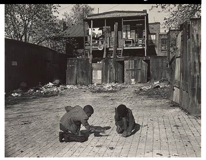
Gordon Parks, Washington (southwest section), D.C. Two Negro boys shooting marbles in front of their home. November 1942