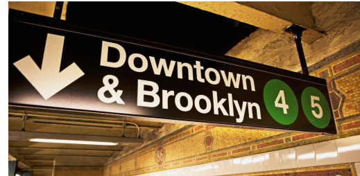
Subway Signage

changes the whole vibe of the team. Personally I think this was the best logo created so far, I feel in the rest of the logos they had too many things going on and some didn't even seem as if they were for a basketball team. This new logo really started change for the nets, they have been winning ever since this logo was created. I'm also very interested to see what they do next with the logo since they have changed it so many times I'm sure they will change it again. The nets note that the identity is based on New York City subway signage from the 1940s and 1950s. Something else found interesting is Jay-Z really pushed for the "B"