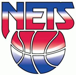
Nets 1990 logo, Source: The best and worst NBA logos

was a whole new design and it lasted for a decade. This was a circular logo and had the state name and the shape of it, it still had red, white, and blue as its colors.