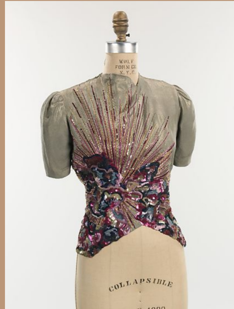
Elsa Schiaparelli, 1938-39, Evening Blouse, MET Museum

I would wear this evening blouse to a fancy dinner involving my birthday or any occasion revolving myself. This blouse seems like a blouse that would be remembered therefore I would wear it on a special day. This blouse would only be worn once as I want to create a statement with it.