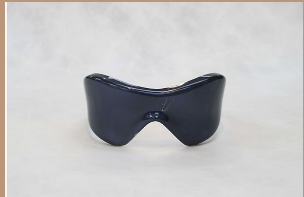
Thierry Mugler, 1998, Blackout, The MET Museum

I am in love with Schiaparelli's designs and I don't think I would alter anything. If I were to ever get one of her garments, I know I would be satisfied. With that said a designer similar to her would be Thierry Mugler. Adding a Thierry Mugler skirt, jacket or accessory would complete and elevate the elegance of the look. An example of how I can elevate my Schiaparelli look is adding Thierry Mugler Sunglasses. These glasses are from F/W 1998-99 collection. Its a "out there" kind of accessory yet its still modern and elegant.