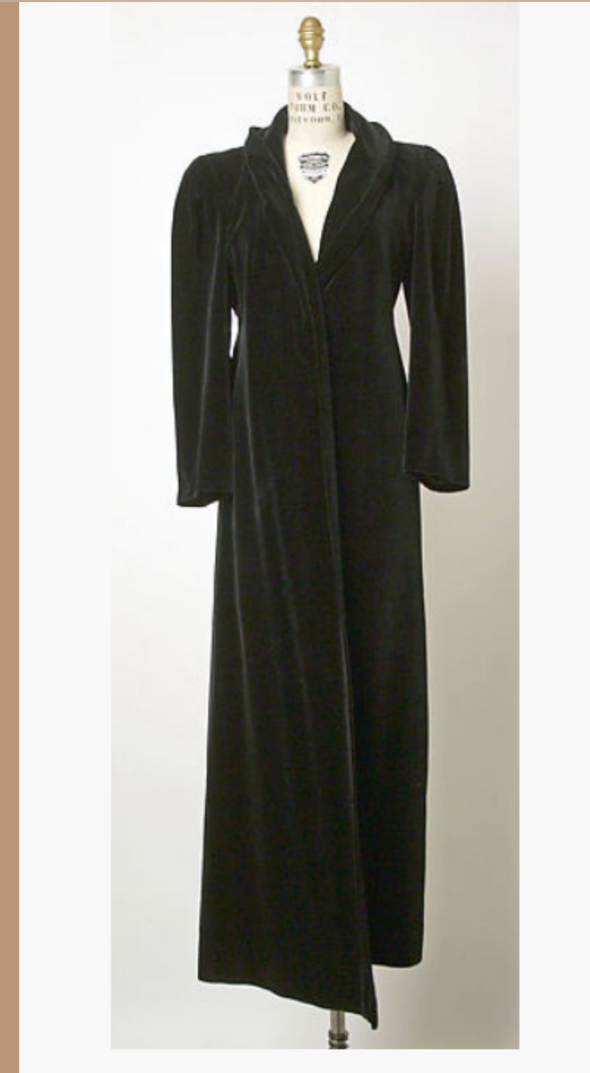
Elsa Schiaparelli, 1930, Evening Coat, The MET Museum

. I like over the top outfits and sometimes when I'm not in school I like to dress up since I work in the makeup industry. I would wear this to a night out or fancy dinner.