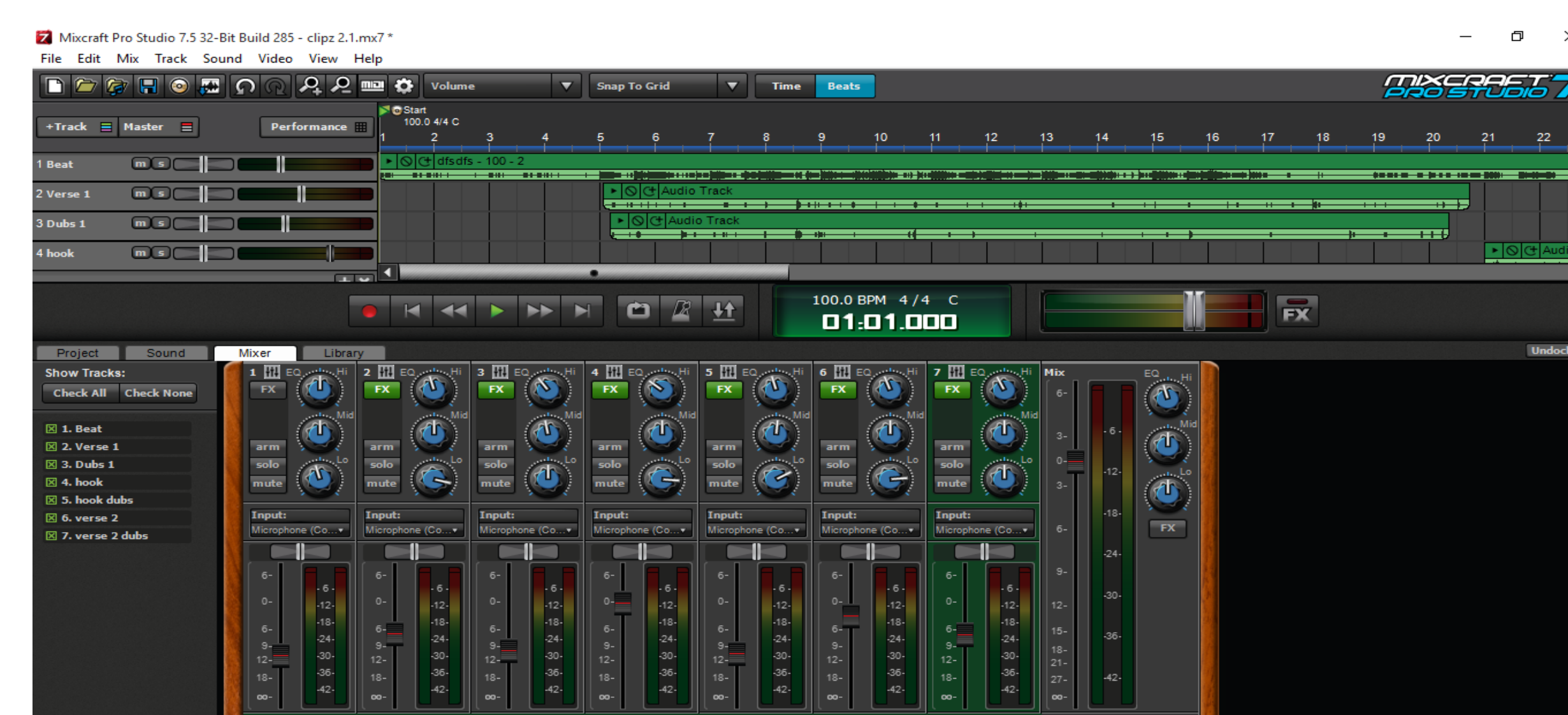
Figure 3. Shows a screenshot of vocals recorded in Mixcraft 7.0 using a Tonor microphone. Two out of three songs had vocals.