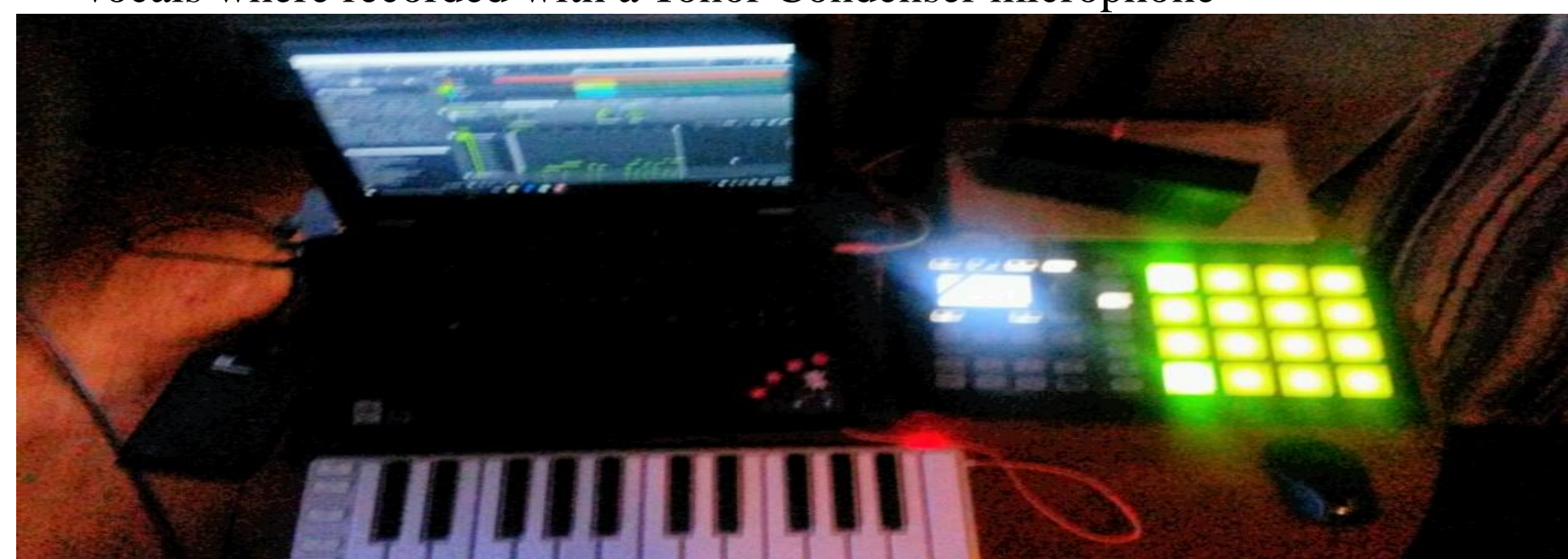
Figure 1. Shows Maschine and the CME Xkey being hooked up to the Lonovo Yoga 2.0.

Vocals where recorded with a Tonor Condenser microphone