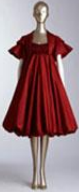
Blossom Sleeve bolero and Balloon dress, spring/summer 2005 Garnet silk paper taffeta, chiffon