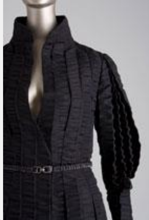
Armadillo Sleeve shirtwaist dress, fall/winter 2008 Black pleated silk taffeta