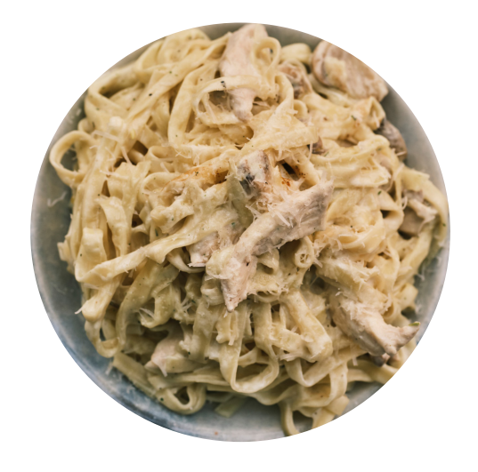
Fettuccine Alfredo fettuccine pasta, romano cheese, parmesan cheese