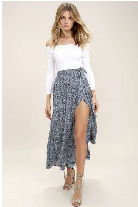
(Figure 33 – Beautiful Tempest Navy Blue Print Wrap Maxi Skirt , 2018)