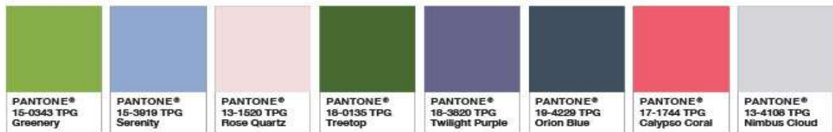
(Figure 30 – Transitions into trending colors , 2018)