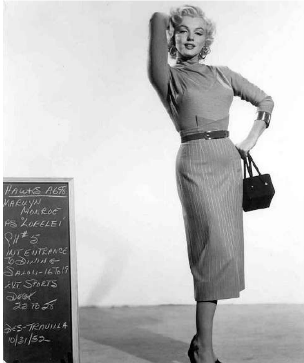
(Figure 22 – Marilyn Monroe, 2016)