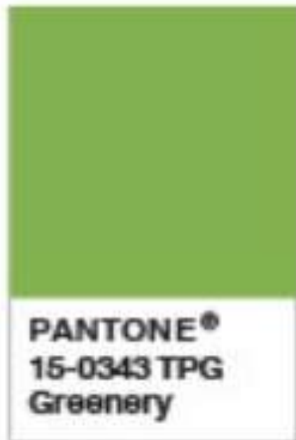
(Figure 4 – Pantone Color of the Year, 2017)