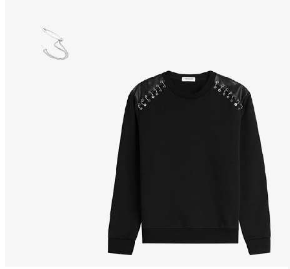
(Figure 7 – Farra, Maison Margiela 2016).

Several factors that will be affecting the trend will be seasons changing and climate change, pop culture, social media and the presidential election. Seasons always have an influence in fashion because climate change is “becoming less predictable each year” (fashioncloudsoftware, 2018). As this continues, trends will be affected because designers need to adapt to these changes. Pop culture is also a driving factor with trends changing. It only takes one person who has enough reach to make a trend, untrendy. This ties in with social media. Social media is a wide platform that anyone can use, this opens up the door to people who are just emerging into the fashion scene, entrepreneur brands as well as larger brands. Social media is another factor that will affect the trend because there is no gatekeeper there, it is open for every single person. Fashion is becoming much more accessible to everyone who