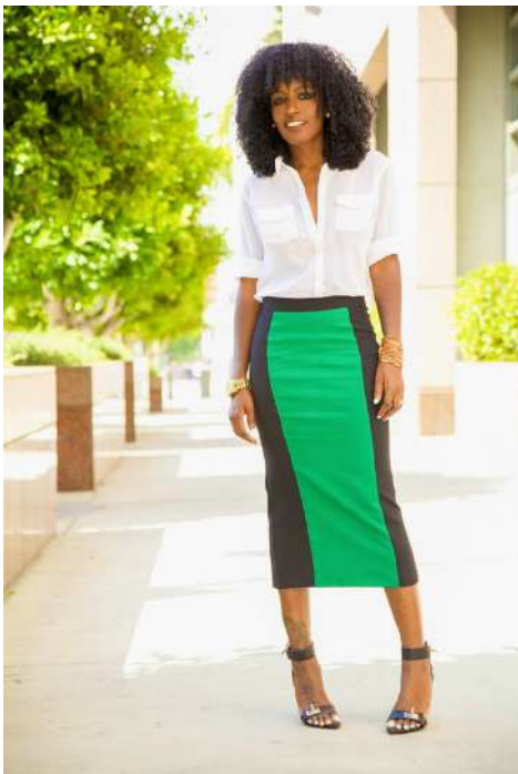
(Figure 25 – Style Pantry , 2013)

Christian Dior created the pencil skirt to be sleek and to be a full embracement of the woman's body. While doing this, he used bold colors and flat patterns that fully complimented the woman. With the pencil skirt being so in trend, it has popped up throughout pop culture including the TV show Friends . Rachel not only wears a pencil skirt but it is also using a light color green with a plaid design included. The versatility of the pencil skirt is in the aspect that it can be used in many different patterns by checkered print, and various others such as animal print, color block and many more. The pencil skirt design allows it be a chameleon in the form of its many patterns and color use. For Spring/Summer 2020, the pencil skirt would use various color blocking themes with tertiary color in lays as the meshing allows for more outfit versatility and showing the continuing trend of women and power with business accents from the classic pencil skirt designs of its beginning by Dior.