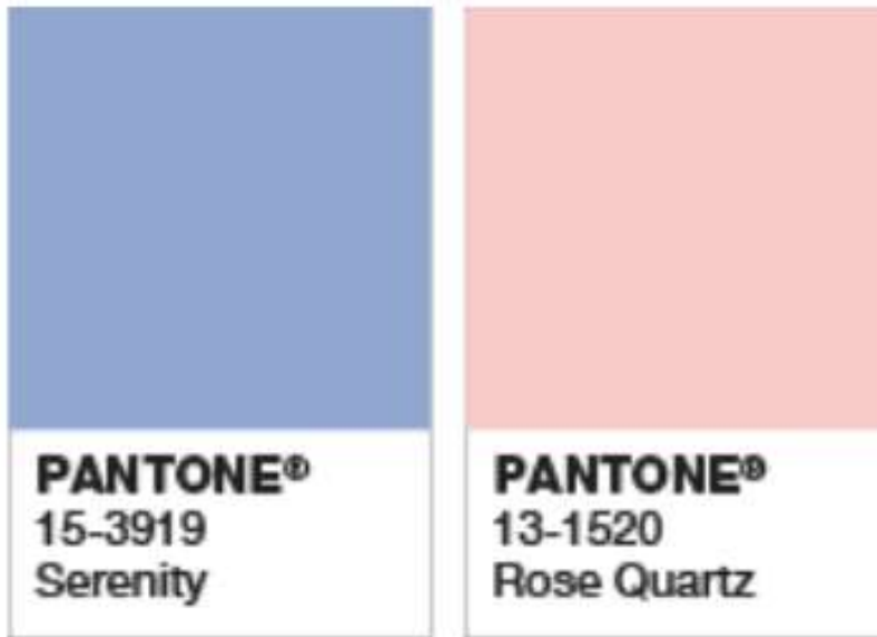
(Figure 3 – Pantone Color of the Year, 2016)

this color may come back, possibly in a lighter shade. Other colors were lilac gray and serenity, (DeSimone, 2015). Pantone has also stated that rose quartz and serenity are the colors of the year