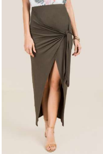
(Figure 32 – Flora Tie Front Wrap Skirt , 2018)