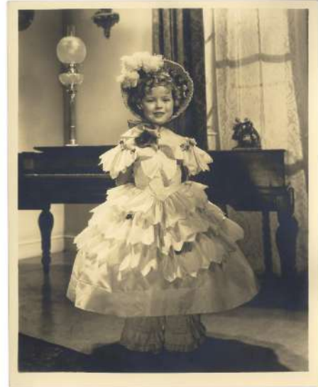
(Figure 18 – Shirley Temple , 2016)

The 1975 film The Stepford Wives , a series of docile, cheerful housewives push shopping carts through sterile supermarket aisles. Blank-eyed, fabulously attired, and with limited brain capacity, they're robotic replacements for real women. Their wardrobes are all pastel and cream, featuring floppy hats, lush curls, and — most notably — elaborately ruffled blouses and dresses. The ruffles are a throwback to the '50s — and a clear statement of delicate womanhood. (Newland, 2017)