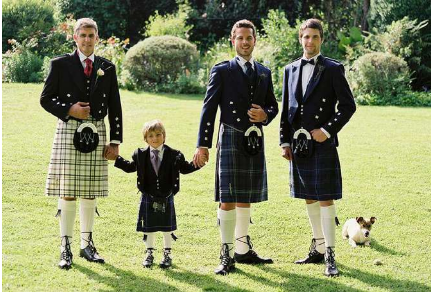
(Figure 1 – Scottish Kilts , 2018)

Plaid has long been a defining pattern in fashion. It has been used in many different garments such as skirts, flannels and linings of jackets. The fabric of plaid can be made from many different materials. Wool and cotton are perfect examples of plaid skirts. Styling this iconic plaid