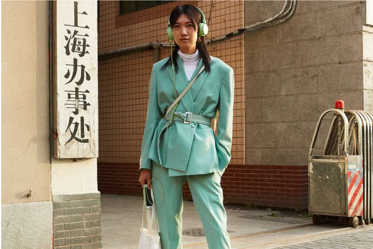
(Figure 26 – Neo-Mint , 2018)

With trends of design and color constantly changing, there is never an exact science to understanding what could be the next it trend. Thankfully, companies like WGSN use a combination of social science, deep insight and instinct to predict trends up to 24 months before they enter the retail space (Grobe, 2018). These companies help predict colors such as the new neon green forecasters think will be hugely popular in the year 2020. Pencil skirts will join in this mega color trend and join the fray. The reasoning comes in two folds, when it comes to a color for 2020, neo mint is an oxygenating, fresh tone that aligns science and technology with nature. Recently, there's been a huge pop culture reinvestment in popular '70s genre cyberpunk, it is a sci-fi genre that warns against the power of technology and AI to overpower humanity (Grobe, 2018). These two factors easily help in pushing the pencil skirt forward as its versatility has always played a huge part in its patterns used and color usage over the decades.