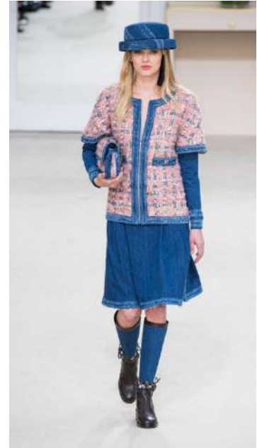
(figure 43 – Chanel 2016)

We predict that in 2 years from now the trend it's going to be a balance of fit and length as shown through past runways shows with Stella McCartney, Julien David, and Chanel. All three skirts have shown a dramatic difference compared to the fitted and short denim that the early 2000s popularized.