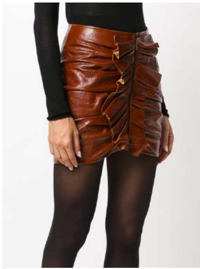
(Figure 12 – Saint