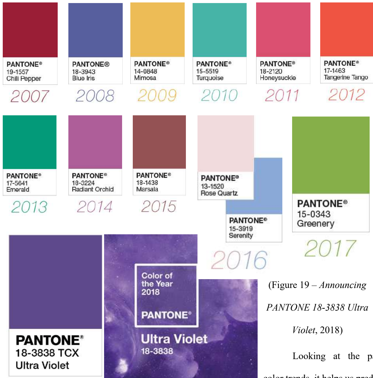
(Figure 19 – Announcing PANTONE 18-3838 Ultra Violet , 2018)

Looking at the past color trends, it helps us predict