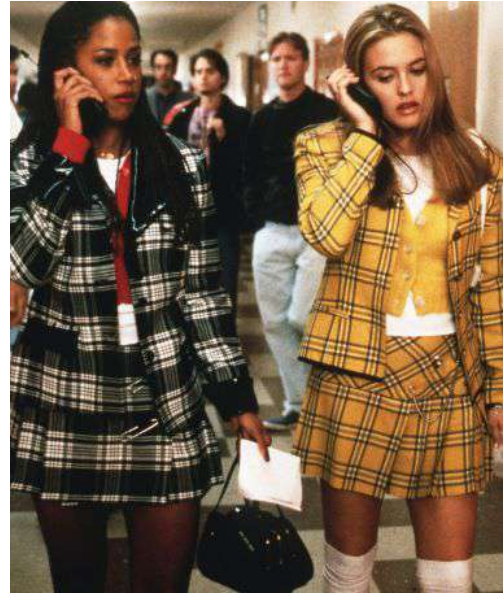
(Figure 2 – Clueless , 1995)

Plaid has had a long history in fashion. It has gone through many phases in history, skipping to the 1970's, it is a form of "liberated, devil-may-care style" (Atwood, 2014). Plaid became a huge pattern and was put on