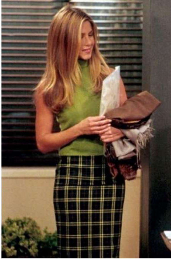
(Figure 24 – Friends , 2018)