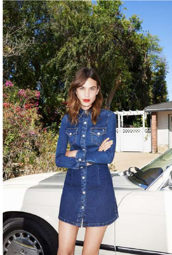
(figure 37 - Alexa Chung, 2015)