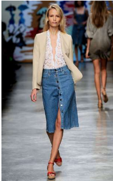
(figure 41 –Stella McCartney 2009)