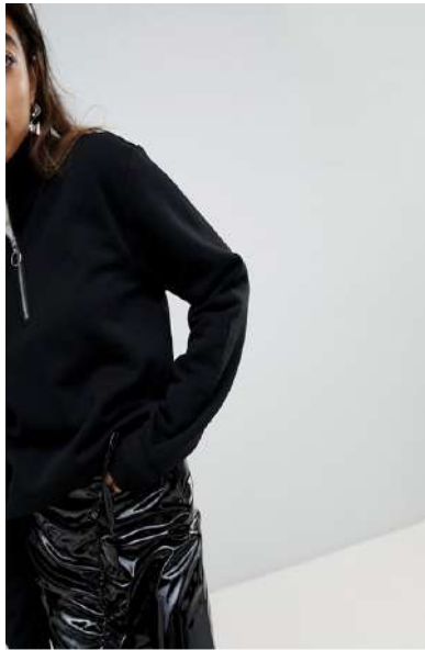
(Figure 11 – Mango, 2017 )