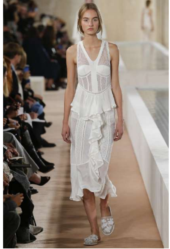
(Figure 16 – Balenciaga Spring/Summer 16 , 2016)

This all began to shift in spring/summer '16, when designers from Gucci to Balenciaga popularized the flourish all over again. Whether layering frills on chiffon dresses or carefully structuring ultra-modern hemlines, sartorial demand for the ruffle seemed to reignite. This gives us the insight that we will still continue the ruffle trend but in a modernized way.