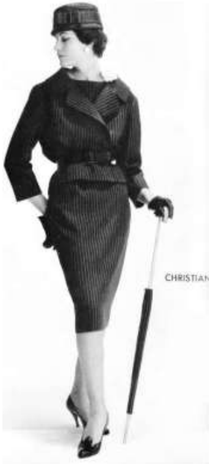
(Figure 21 – Christian Dior , 2010)

The genius of the pencil skirt is its ability to not only manufacture its sex appeal for a woman but also personify class and become the modern uniform for woman. During the 1940s, Christian Dior cultivated this skirt by embracing the sleek design, ridding the skirt of its excess ruffles at the time (Wright, 2016). By doing this moderation, Dior created a classic that would allow women to fully embrace the femininity of their curves and still allow them to go to the work place. The length of the pencil skirt made it perfect for the modern work place in the beginning periods and still created an aura around itself by being so different from previous renditions of skirts with designs of a-lines & ruffles. The new pencil skirts allowed women to show off their feminine curves, and not be quite as impeded from going about the business of daily life as they would have been in the immediate post wartime fashions (Wright, 2016). Furthering the classic pencil was Marilyn