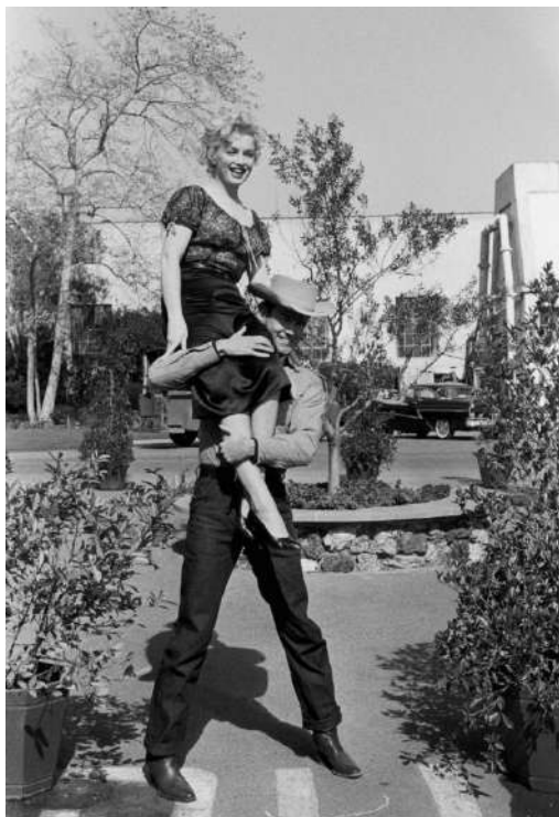
(Figure 23 – Marilyn Monroe and Man, 2016)

2018 revealed shortening lengths of many designs including the skirt. The pencil skirt style is cut straight down, and when laid flat, forms a rectangle (Schwanke, 2015). Using the cut straight down look, the pencil skirt reaches down all the way to right above the women’s knee. The length also allows the skirt to fully drape down the woman’s body giving it elegance and visual perception. Yet through time and generations, a new creation was created in the 60s. Mary Quant was using new altered designs to create new mini pencil skirts well above at 6-7 inches above the