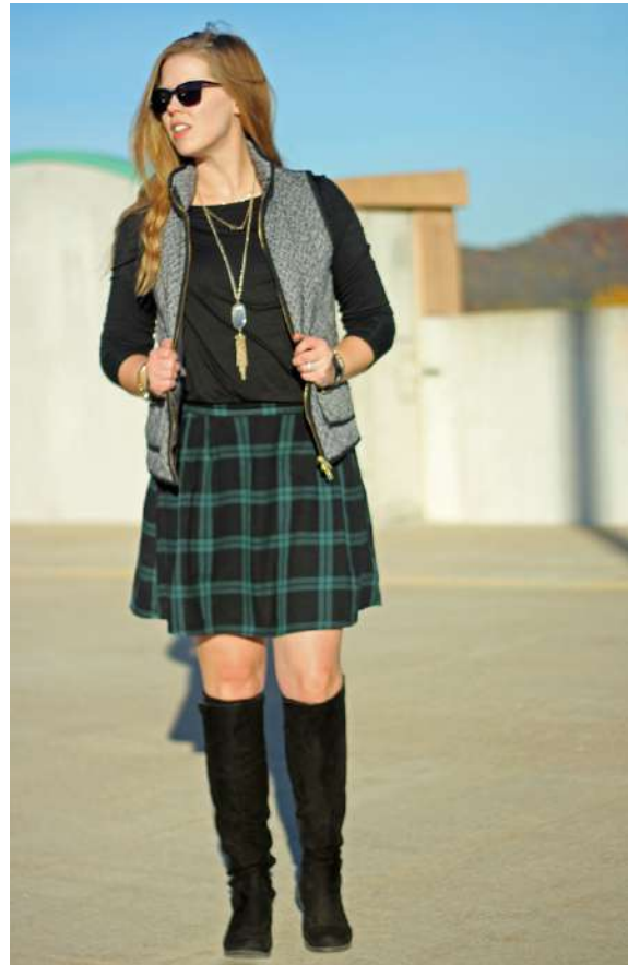
(Figure 6 – Schoolgirl , 2015)

As stated before, the changes will be coming from color. Length will also be a changing factor because of the pendulum swing. The pendulum swing goes from one extreme to the other, therefore, when it reaches an extremely short length, the pendulum will swing back bringing the skirt back to the longer side. This can happen for a number of reasons such as season and longer skirts trending. The swing can also happen with color, since it seems as though the colors are turning towards a lighter shade, it will surely go back to the classic, dark colors as pictured in figure 4. Cultural causes play a big part in trends as well. Since forecasters are trying to predict trends for the year 2020, a huge political event will be upon us. The election played a huge part back in 2016, people started accessorizing with safety pins and many anti-Trump attire came out. The safety pin to show support “amid fears of abuse against minorities, immigrants, women and members of the L.G.B.T.