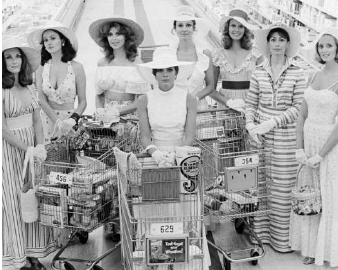
(Figure 17 - The cast of The Stepford Wives , 2017)