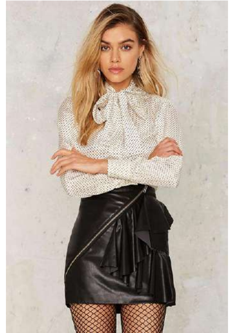
(Figure 9 – Nasty Gal , 2017)

Recently, ruffled skirts were presented differently in varying materials. Several examples include materials such as patent leather, leather, and denim. The style was a mini skirt and the color was in burgundy, reds, black, purple, and green. It was bold but dark at the same time. The fit was square and the silhouette overall was a boxy fit. This trend was very rocker chic and grunge (Dobrzykowski, 2017), since it gave off this vibe, this trend was very rebellious as well. Sometimes zippers were added for an edgy look. Also, the skirts would have many ruffles much like the ones on shirts and dresses (Sutton, 2016).