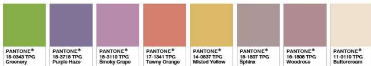
(Figure 31 – Fresh muted tones of bold colors for 2020 , 2018)