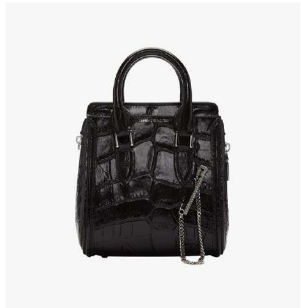
(Figure 8 – Farra, Alexander McQueen 2016).

wants to see it and trends are changing because it seems as though the cycle is being pushed through faster. “The market is so saturated with new bloggers wanting to break into the industry” (Fateh, 2017). Since it’s much easier to access an app than to pay for a subscription, trends are seen here much faster than the traditional publication. It is almost as if the gatekeeper is becoming