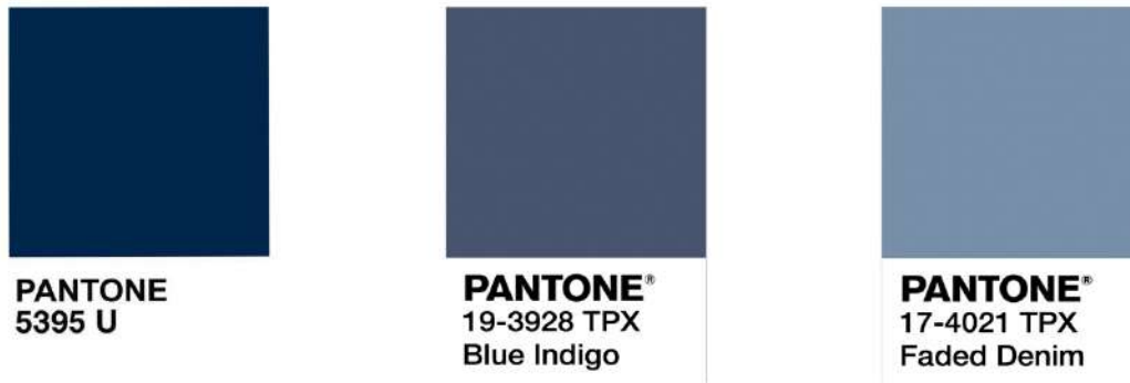
(figure 34, Pantone, 2017)

The pantone colors have always been in and are always the colors everyone tend to grab when it comes to denim. 5395 U dark navy color is the universal jean color that is easy to combine with multitude of colors. “Dark denim also offers an easy, understated way of tapping into this season's tricky Western trend. At Versace, denim shirts with Western collar tips were styled with golden baroque prints, while models at Givenchy wore oversized denim jackets with cowboy boots” (McGrath, 2018).