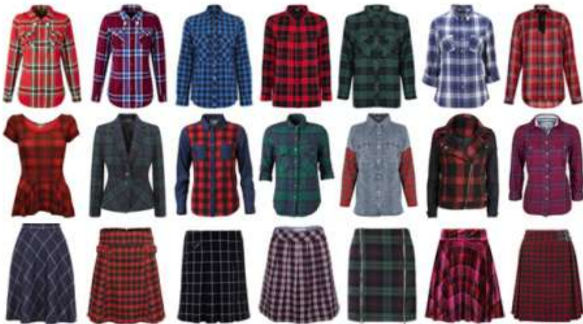
(Figure 5 – The Real Skinny on Dressing Slim , 2015)

Plaid is still a forceful pattern in the industry. Since it is so diverse, it can be used on so many different kinds of garments, shapes, colors and silhouettes. Plaid may change by color and length in skirts. The skirt will keep their classic colors such as navy blue and forest green but maybe the colors might change to a new shade of pink or orange when Spring/Summer 2020 come along. Plaid will always be a classic in every person's wardrobe whether it is a jacket or skirt.