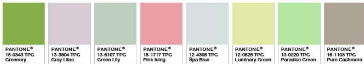
(Figure 29 – Past colors of pastels , 2018)