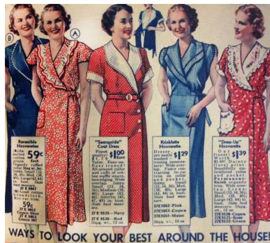
(Figure 27 - Hooverettes, 2010)

Wrap skirts are timeless and adds a playful twist on a pencil skirt. Although one might say Diane Von Furstenberg was the inventor of the wrap dress, during the Great Depression, “Hooverettes” were popular (Brackman, 2010). They had a wrap design, however it was on the upper bodice, not on the skirt. The Dictionary of American Regional English defines Hoover Aprons as “slang for a coverall or house dress with an overlapping reversible front and the wrap-front dress could be worn until the bodice was dirty and then the overlap reversed to reveal a clean area.” (Cassidy & Hall, 1985). These were used for women to do work around the house and reflected the zeitgeist of the times.