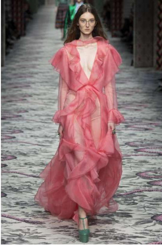
(Figure 15 - Gucci Spring/Summer 16 , 2016)