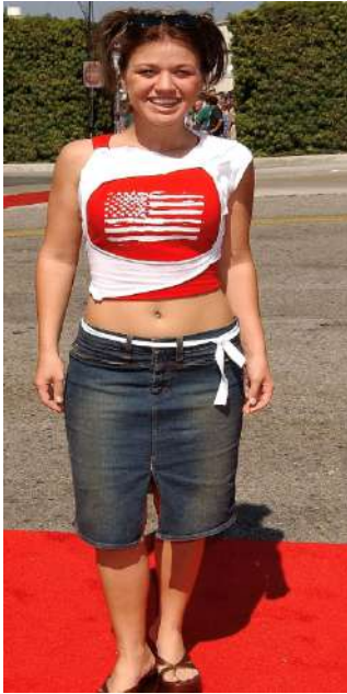
(figure 38 –Kelly Clarkson 2002)