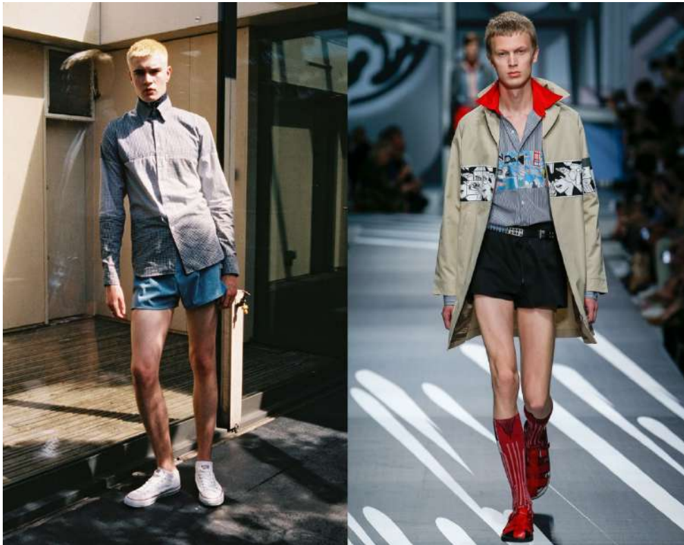
(figure 36 – Christopher Shannon Fall 2018 mens (left), Prada Fall 2018 mens (right))

From light to dark washes and mini to midi lengths, denim skirts are a must-have staple for spring. Consider them the perfect piece to swap out your skinny jeans with. Plus, denim skirts are versatile enough to wear with your favorite booties and crisp white button-down for a timeless office look. You can even wear one with sneakers and a chunky cardigan for an easy weekend outfit. Denim skirts are also perfect for all those upcoming spring break plans you've got in the works, as the material makes for the perfect wrinkle-free travel companion. (Carbone, 2018)