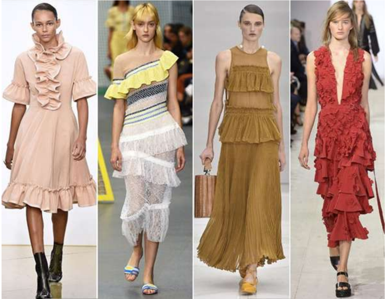
(Figure 20 – Instyle , 2016)