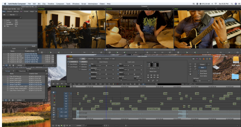
Figure 3: Checkerboard editing in Avid Media Composer