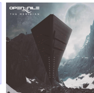
Figure 6: Open the Nile "The Meridian"