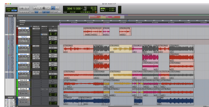
Figure 4: Pro Tools session of recording