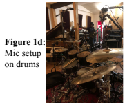
Figure 1d: Mic setup on drums

Post-production: - Mix audio and get feedback from band and advisor and apply any notes/suggestions