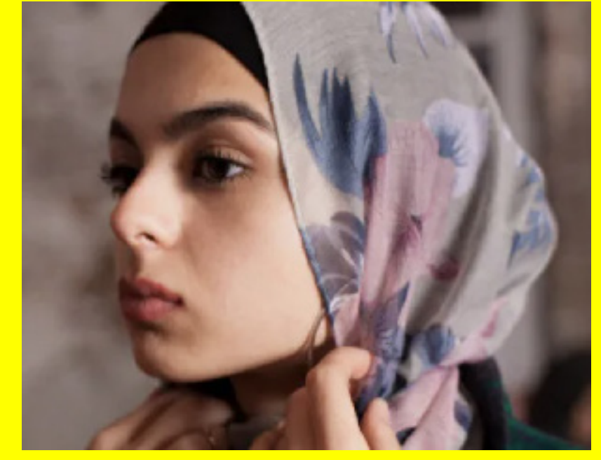
The next scene sees the women put her hijab on. However, she looks worried.