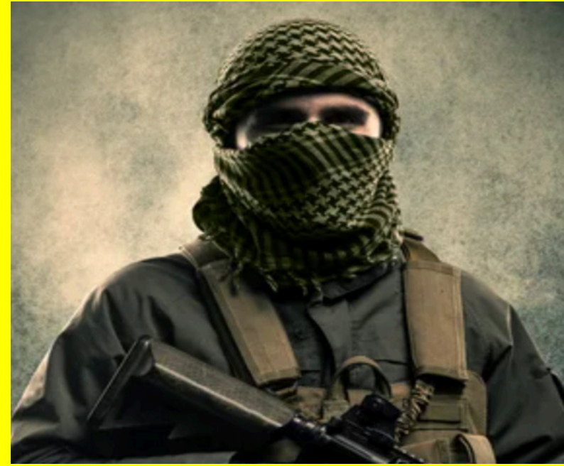
Then it cuts to a close-up shot of the man holding the gun. Staring at the camera sternly.