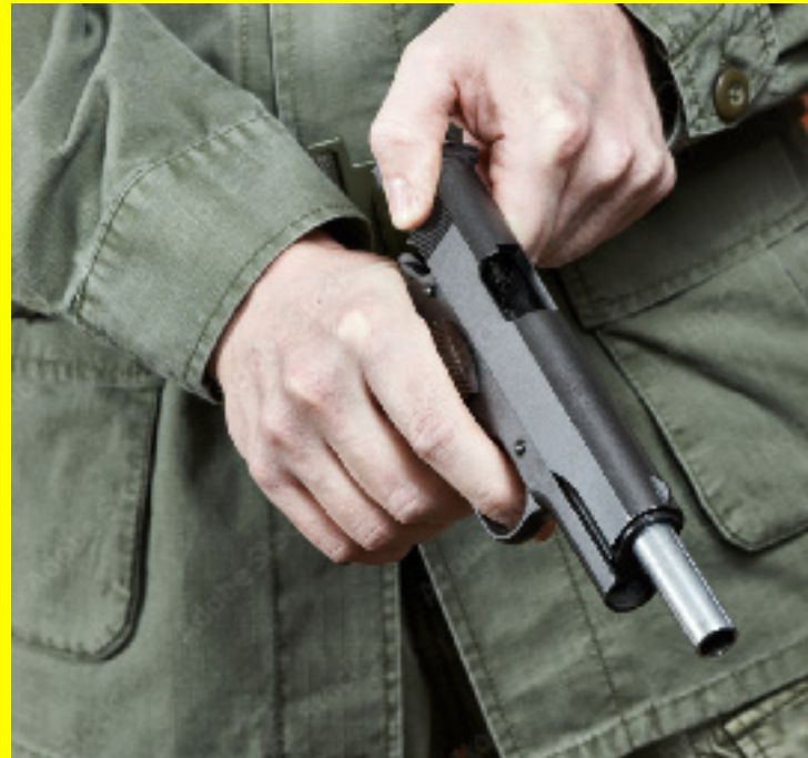
The next scenes has a different man reloading and cocking his pistol ready to fire on any protestors.