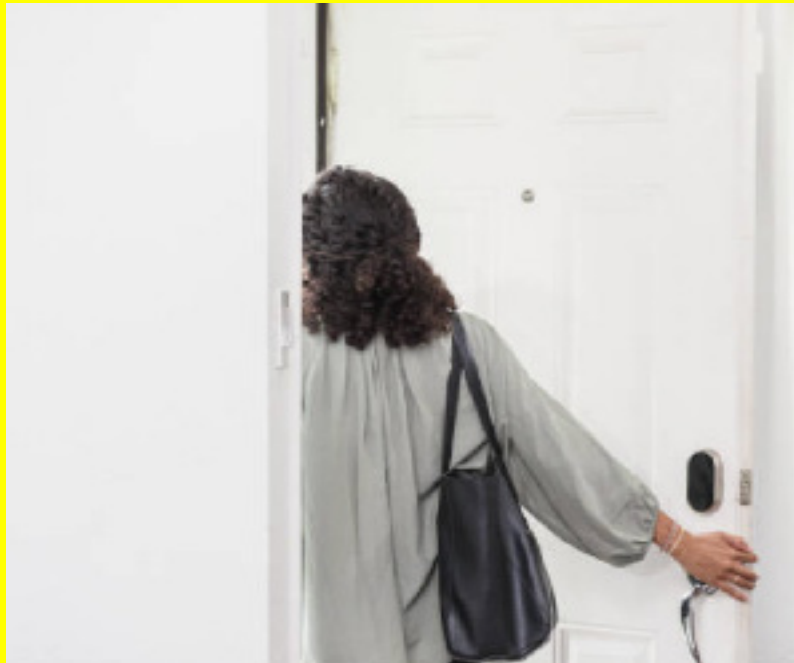
The next scene shows us the same girl leaving her house to join the protest without wearing her hijab.