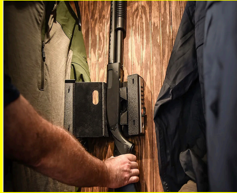
Video starts with a man getting a shotgun out of his locker. Ready for a riot/protest.