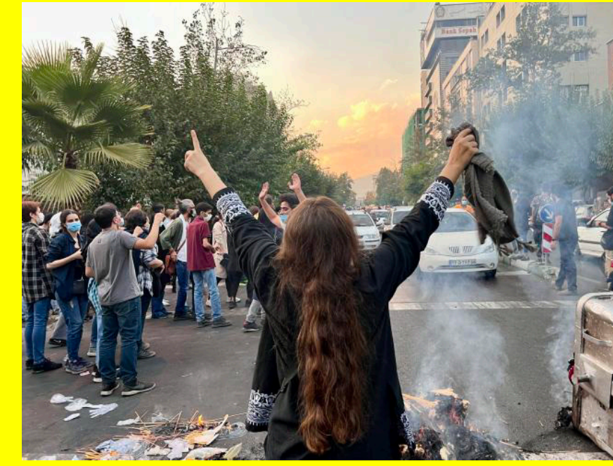
"At least 362 killed in Iran protests..." "No one should be intimidated by a scarf" "Women have the right to choose"