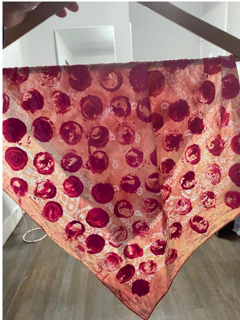
After doing both my patterns before the final dry