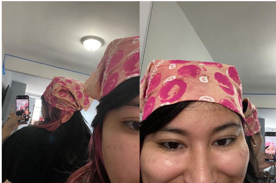
Final Look: Me in my garment!