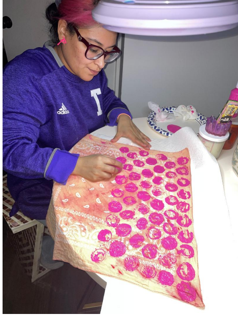
Here I am doing the straight pattern w my dotting tool