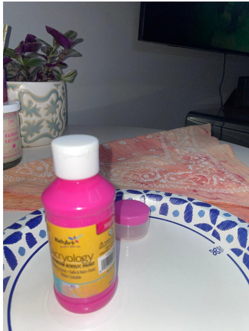
Acrylic paint/pink & pattern dotting tool

The shibori water bottle technique worked great with the size of the bandana. I would of tried wrapping the rubber bands tighter and perhaps adding more to give a more tie dye effect