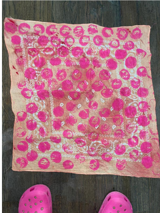
Top part is the straight pattern Bottom is the half drop pattern