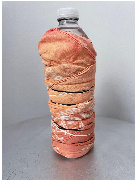
Shibori Resist Dyeing Technique

This was after 2 hrs of sitting in the tub soaking up the Disinfectant Bleach Cleaner