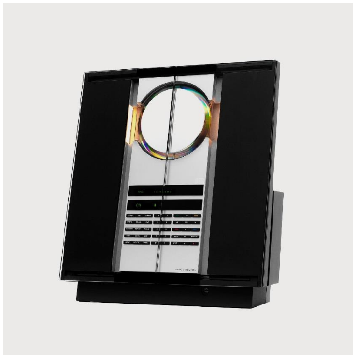
one example of this beosound 3200

product they made in 2003, as past marketing