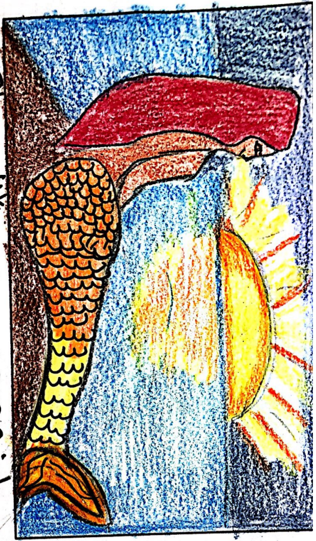
Slay like a mermaid