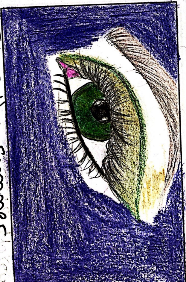
It's the summer 2018 hottest looks.