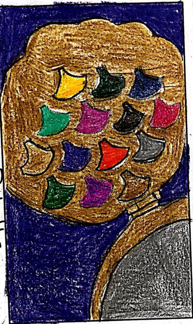
The Mermaid Palette