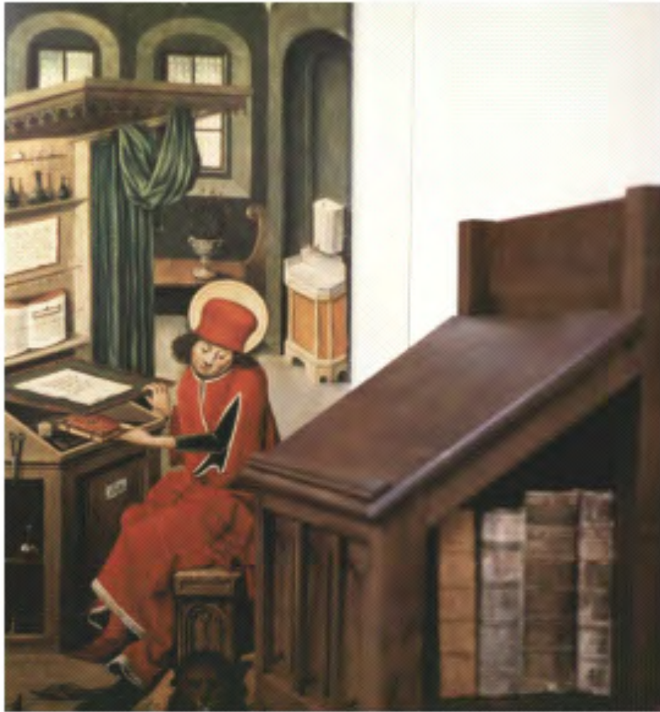
A scribe during the 1400s.