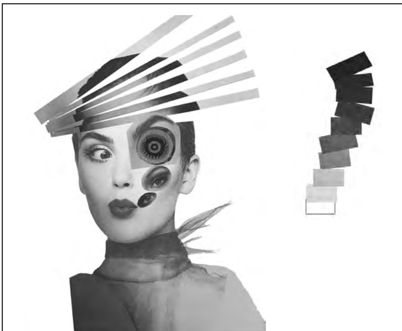
Sample of Finished Work - Bristol Board 14x17"

In the post, document your thoughts about this project. Think about what you learned, what you could have done better (Planning, material use, craft), and how you will apply what you learned to your next project. Consider and respond to the comments made in class during the critique.