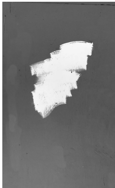
Obvious figure/ground example