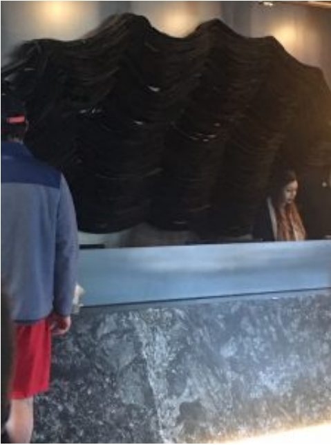
This is a rubber tire which was collected to make an art out of it.[/caption]

"Hospitality starts with the genuine enjoyment of doing something well for the purpose of bringing pleasure to other people." Danny Meyer, USHG https://openlab.citytech.cuny.edu/hmg1101spring18goodlad-schaible