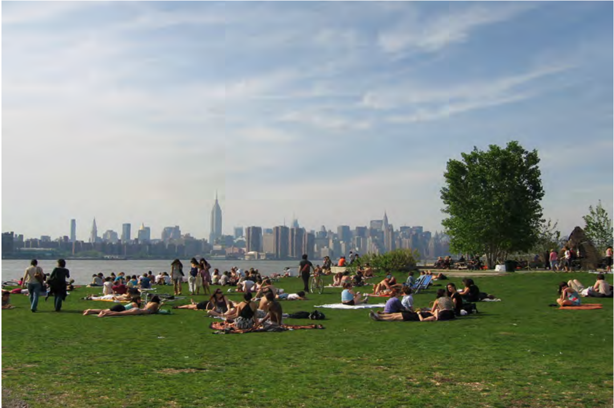
East River State Park