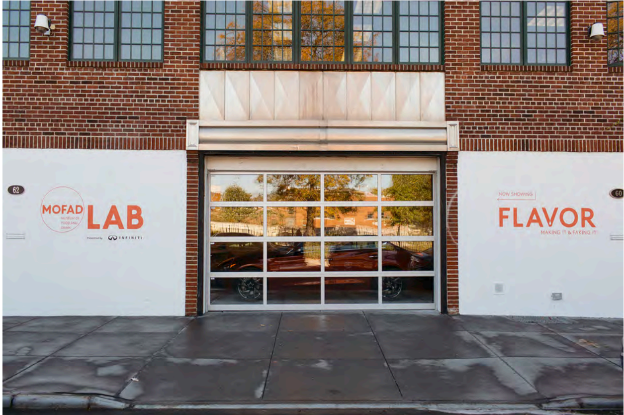
MOFAD, photo credit: TRAVEL+LEIURE