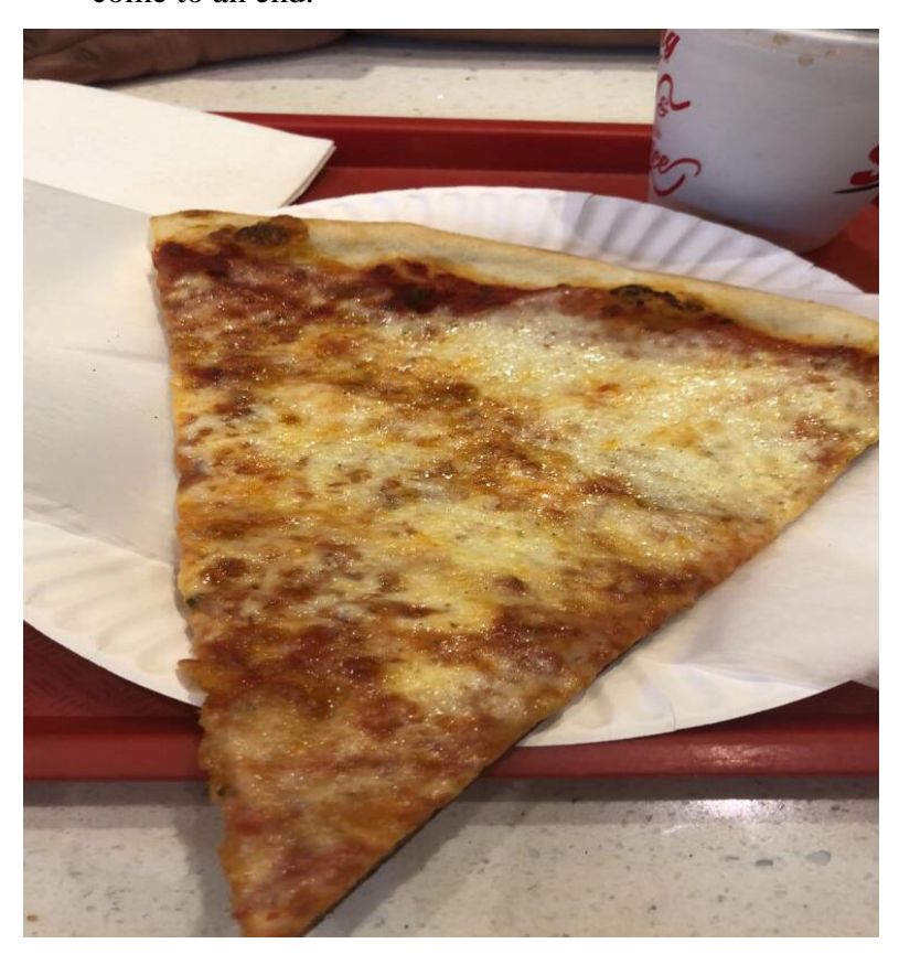
Lean Crust Pizza, (Photo By Gharbia Bhatti)

Now that you have paid your respects it is time for dinner at Lean Crust Pizza. This pizzeria offers a wide range of selections to choose from , they have almost everything from gourmet pizza pies to your regular on the go pizza slice . That's all for now your time in Brooklyn has come to an end.