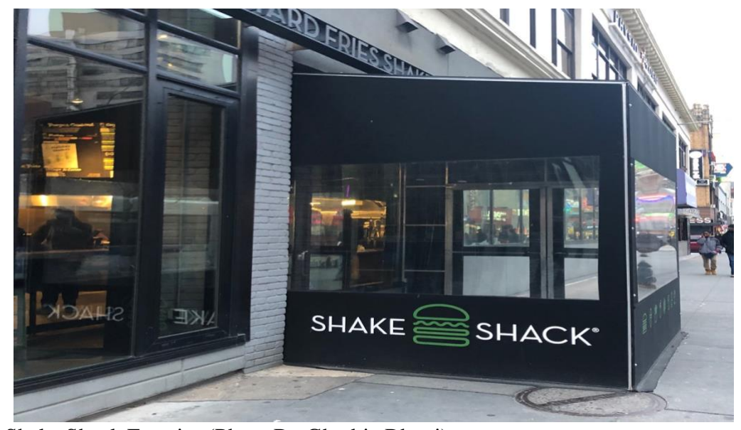
Shake Shack Exterior

Craving Dinner after an adventure filled afternoon at Prospect Park?! It's time to refuel and reserve your energy for Saturday. Visit the famous Shake Shack located at 409 Fulton St. Brooklyn, NY 11201. Satisfy your hunger with a 100% Angus Beef burger alongside French fries and for dessert order the "Shack Attack" custard.