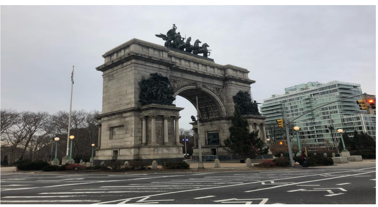
Soldiers And Sailors Arch, Brooklyn NY

After your healthy and nutritious lunch take a fifteen minute walk to the Grand Army Plaza. The Grand Army Plaza was used as an entrance in the Borough of Brooklyn. Another landmark that is next The Grand Army Plaza is the Soldiers and Sailors Arch which commemorates the fallen soldiers of the Civil War. This location is also historically significant because it signifies how Brooklyn came to be, New York during the Civil War was a free state hence why the structure is built to pay a tribute to those heroic soldiers who fought to end slavery in America, "The arch was built between 1889-92, commemorating Union forces that died in the Civil War. MacMonnies's huge quadriga sculpture on top was installed in 1898, and the two groups on the south pedestals representing the Army and Navy were added in 1901." (Brooklyn Public Library)