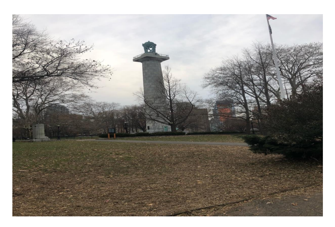
Prison Ship Martyrs Monument Brooklyn, NY

Board the Manhattan bound A train and exit at Lafayette Avenue and walk towards the monument. This monument was built to remember the 11,500 martyrs whom fought against the British Monarchs to conquer the island of Manhattan . Many soldiers passed away due to starvation and thirst . This monument was built upon the permission of the general in charge in 1776.