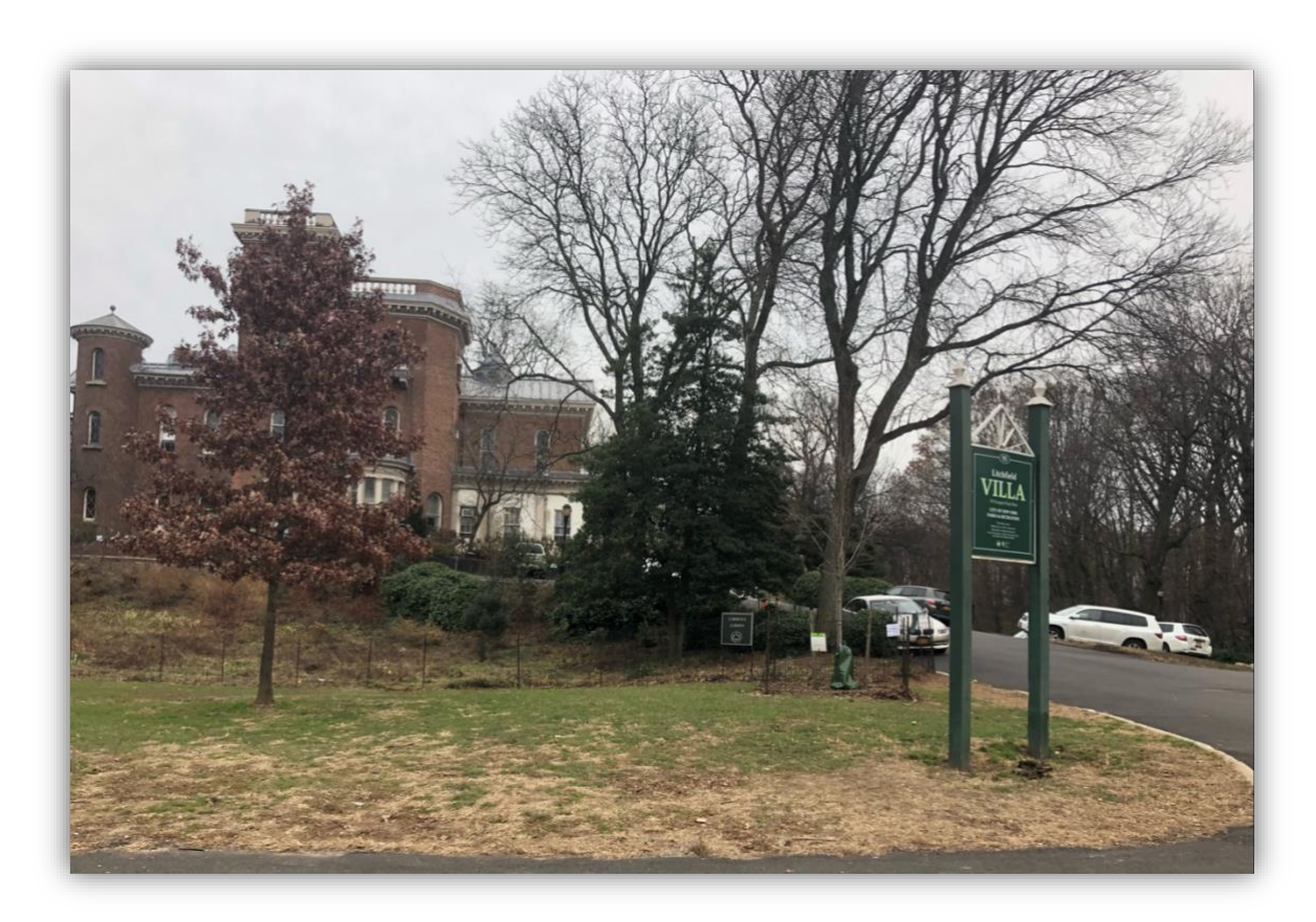
By: Gharbia Bhatti

A view of Prospect Park, Brooklyn