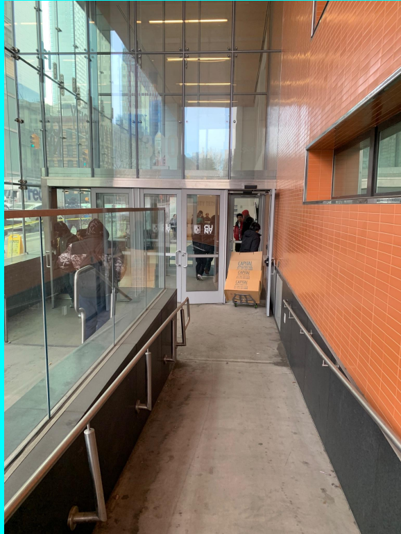
Starting Point (NAMM Building)