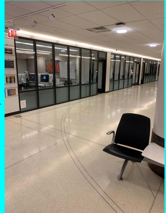
You are here at the Defined Location