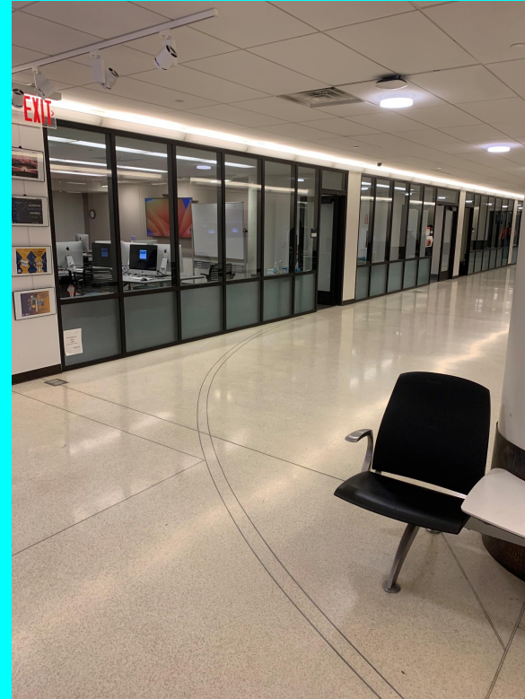
End Point (Defined Location)

Next Slide shows a map as a photo survey of how to get to the defined location