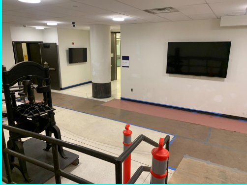
Entering the Pearl Building